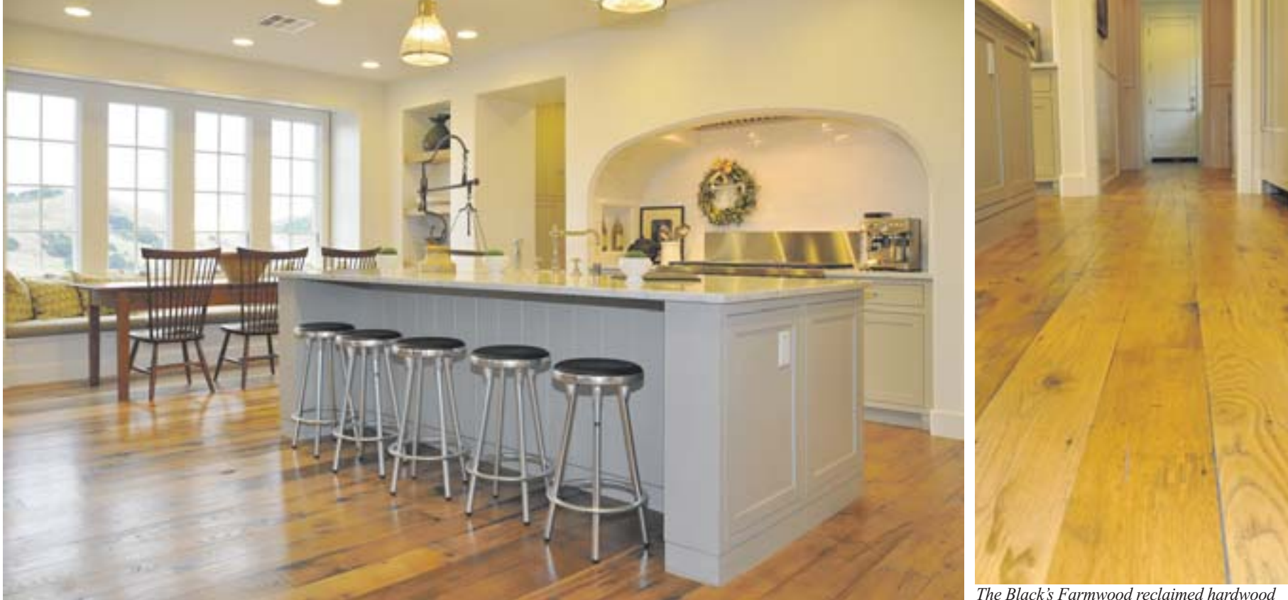
The large, open kitchen of the Wilder model home.