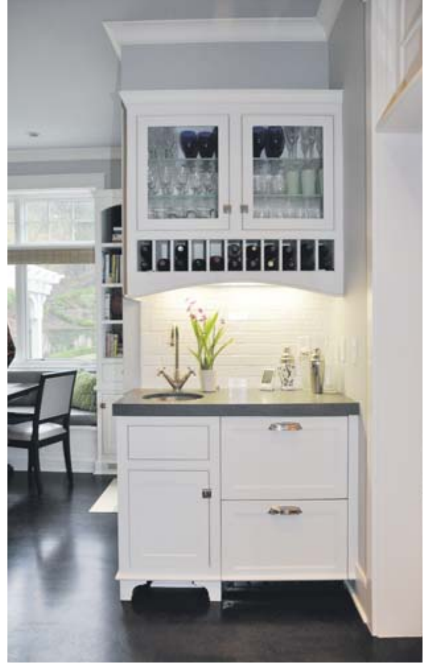
The beverage corner, with a refrigerator below, in Jasper's kitchen.