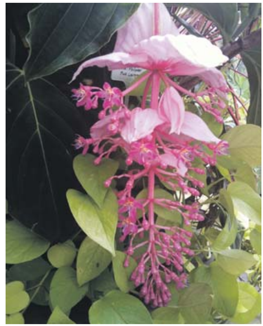
Pink Lantern lights up a wintery day in the Strybing Arboretum.

San Francisco Flower & Garden Show, "Gardens for a Green Earth", San Mateo Event Center, San Mateo, Calif., March 21–25, 2012, www.sfgardenshow.com