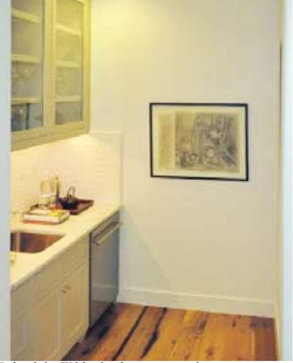
Behind the Wilder kitchen is a complete prep area.