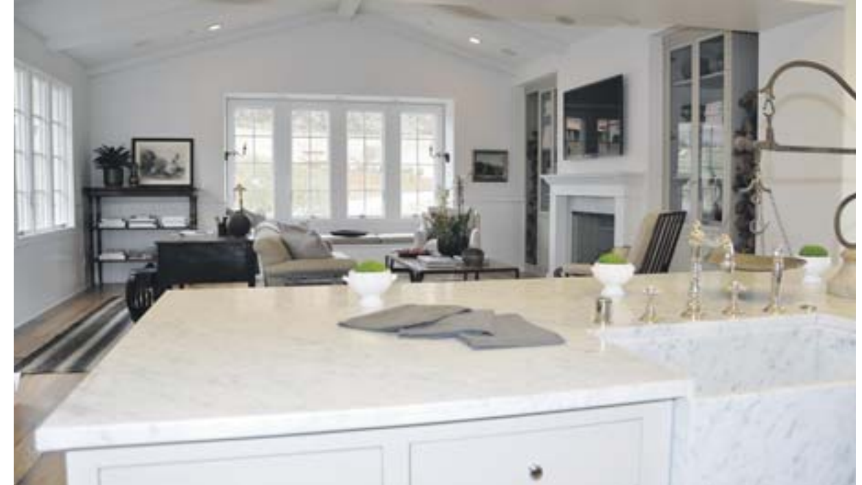
The Wilder kitchen, with a marble island and sink, opens onto the family room.