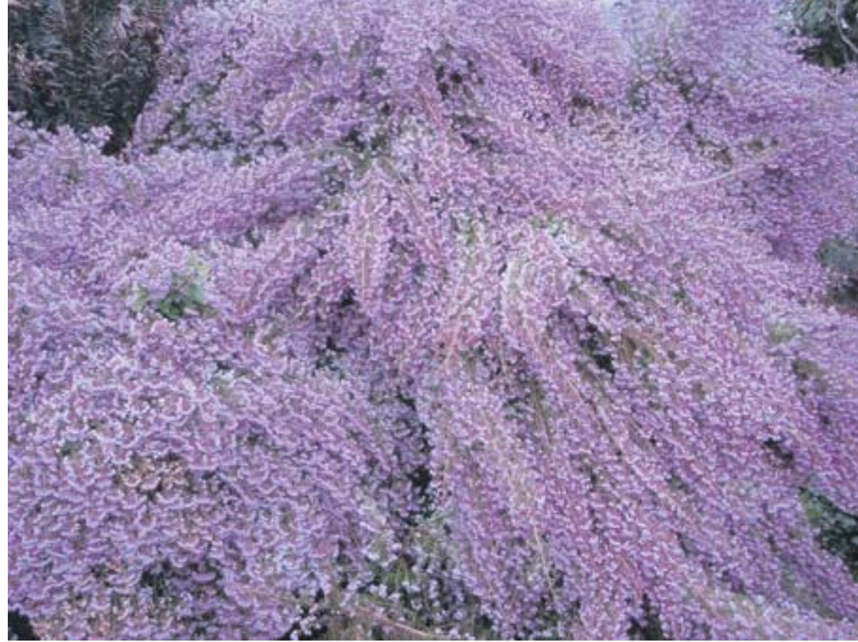
The pink/purple blossoms of Heather brighten a winter landscape.

"The real voyage of discovery consists not in seeking new landscapes, but in having new eyes." Marcel Proust