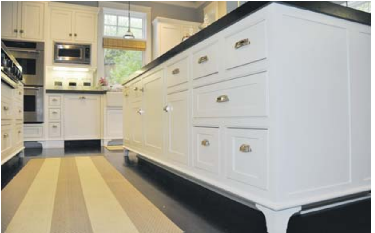
Timeless detail adds to the ambience of Jasper's kitchen.

For the layout, she asked for a large nook area where her young sons come and do their home work, and for entertaining, she had the architect create a 'butler's pantry', a space between the kitchen and the formal dining room where dishes, wine or plates can be set for convenient serving.