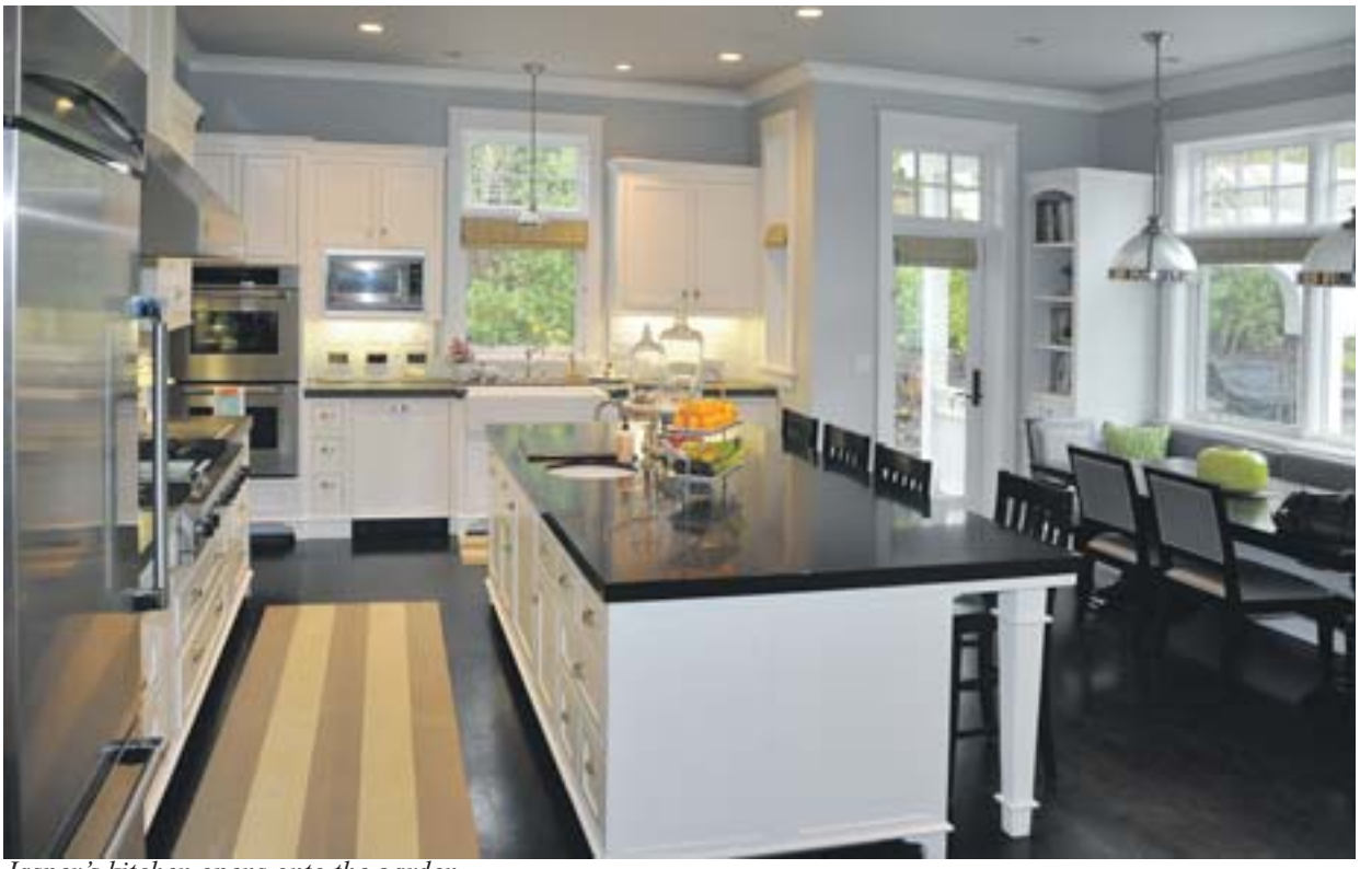
Jasper's kitchen opens onto the garden.