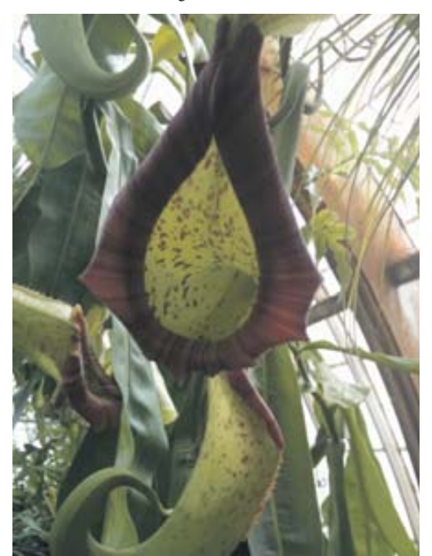
The pitcher plant drinks from its cup to satisfy it's water needs.

This Valentine's give yourself and your loved ones the gift of natural attractions. Even for the timid traveler, it will be love at first sight.