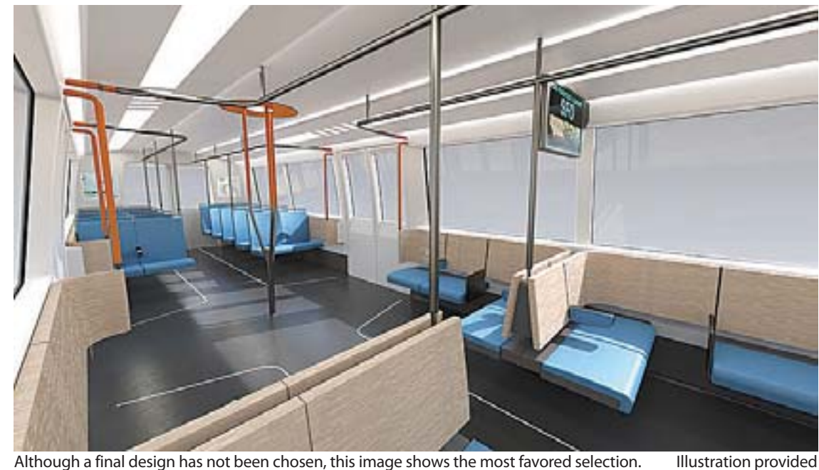
Although a final design has not been chosen, this image shows the most favored selection.

with a layout that allows for more sign. "We've had robust public room for bikes, wheelchairs and feedback to the program," said packages made possible with BART input from approximately 10,000 riders and concerned residents. "The public spoke loud and clear Deliveries of the road tested shiny that maximizing seating was a top priority. Designing seat configurations is a delicate balancing act of comfort and capacity," noted a report from BART on their Fleet cars for Phase 1 should run from of the Future.