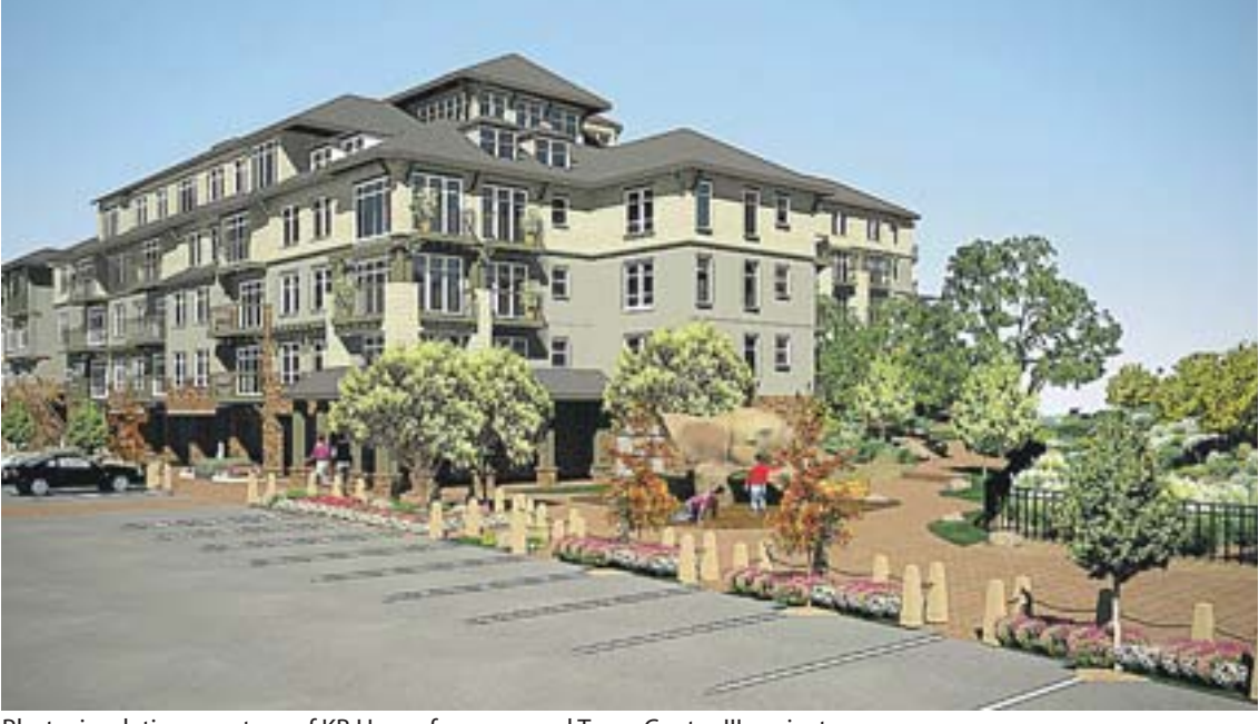
Photosimulation courtesy of KB Home for proposed Town Center III project.

ow best to erect story poles on now, after a long, complicated history a constrained lot? Just behind current developer KB Home has pro-Panda Express is a one and a half acre posed a five story, eighty-one unit submitted. gravel BART overflow parking lot. apartment complex for the site. Back Although it doesn't look like much in August of 2010, story poles were that's why they are proposing this al-