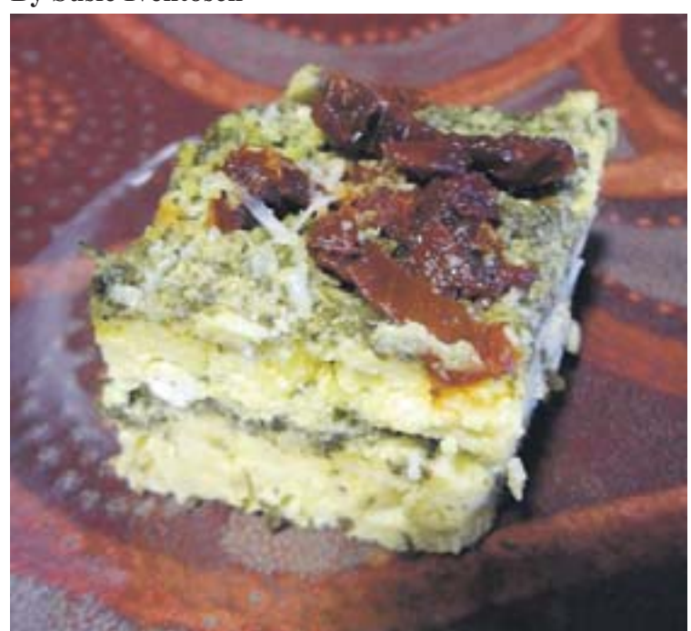
A slice of polenta torta