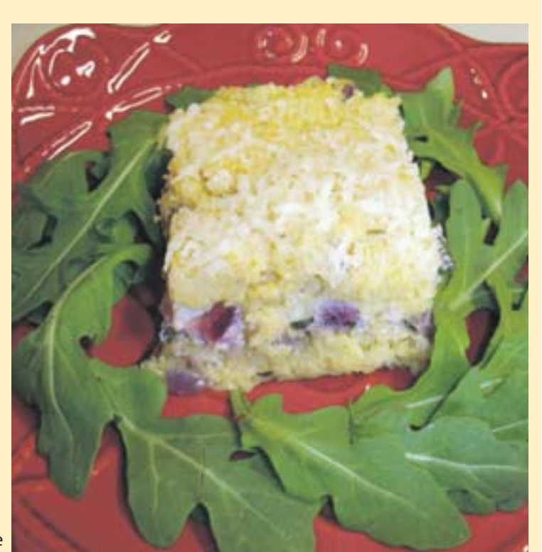
Polenta, arugula, and goat cheese torta