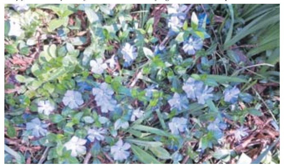
Blue periwinkle, also known as vinca minor, is not edible. It's a great ground cover.