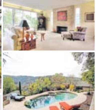
Sunny OCC Mid-century modern. Courtyard surrounded by walls of windows.