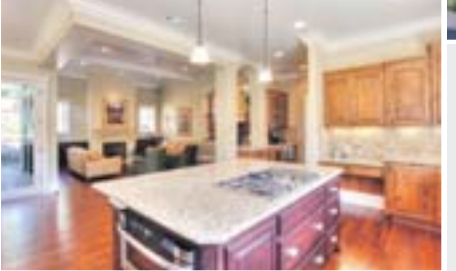
5 BR / 3.5 BA 3987 SQ FT .97 AC Offered at $2,795,000