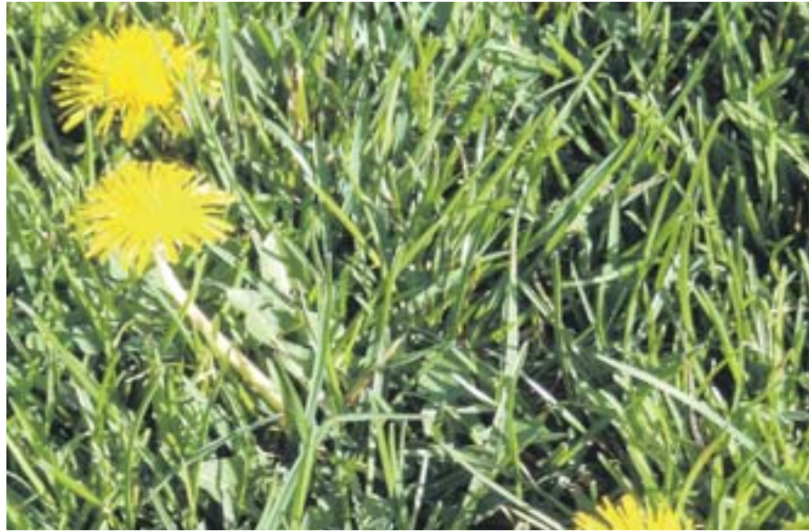
The word "dandelion" comes from the French "dent de lion" meaning lion's tooth because of it's serrated leaves.

Spring has sprung. Let the grass grow while you bunny hop to your own personal field of greens.