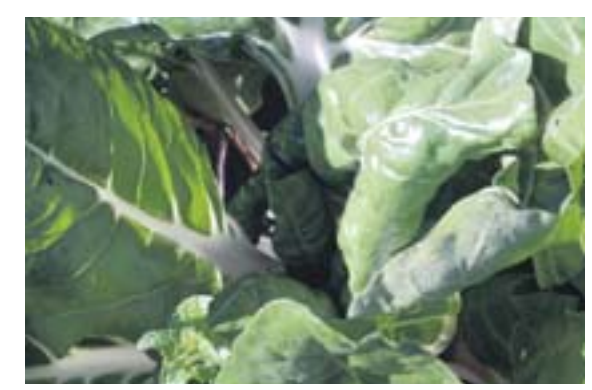
Deep green, nutrient rich leaves of Swiss chard.

Chickweed Chicory Dandelion Fennel Henbit Lamb's Quarter Milk Thistle Plantain Prickly Lettuce Purslane Sorrel Shepherd's Purse