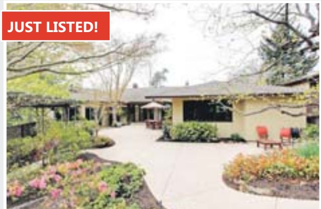
91 Acacia Drive, Orinda $1,150,000 3 BR + office/ 3.5 BA 3041 SQ FT