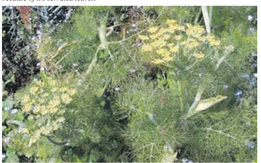
Lacy fennel with yellow fennel blossoms with forget-me-nots interspersed.