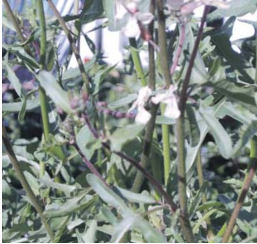
Tender, spicy shoots of wild arugula....Cynthia's favorite forage.

ll winter long the Lamorinda hillsides struggled to shed their golden grasses as they thirsted for showers of life giving rain. Fi-Inally the precipitation carpeted the landscape in lush emeralds where grass seeds sprouted producing weeds that feed.