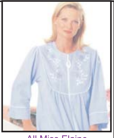
All Miss Elaine Seersucker Robes

Mother's Day is Sunday, May 13<sup>TH</sup>