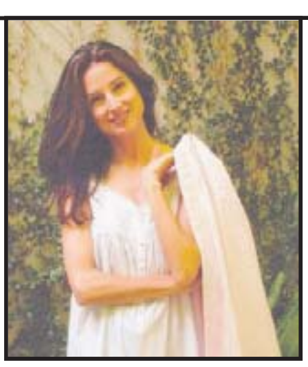
Eileen West Sleepwear