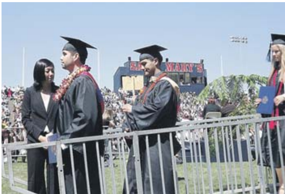
Saint Mary's graduating students cue up to receive diplomas at the May 19 commencement ceremonies.