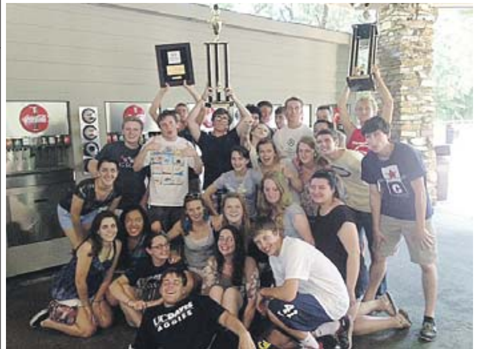
Campolindo Chamber Singers show off their trophies