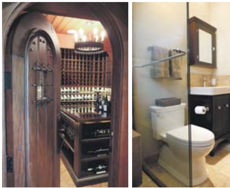
1,800-bottle wine cellar

For more information about Hetherwick-Hutcheson Design, visit the company's website: h-hdesign.com.