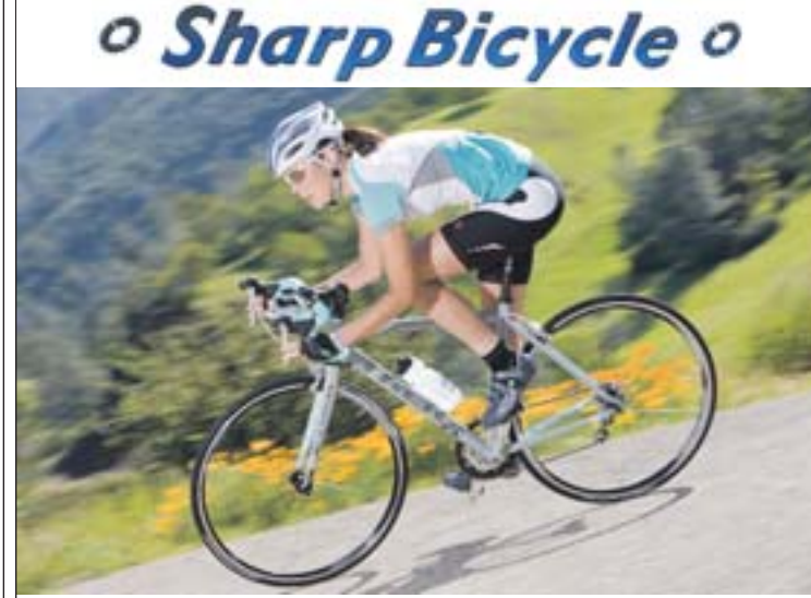
Full Service Bike Shop: Repairs | Tune-ups | Fittings Over 250 Bikes in Stock! Trek, Gary Fisher, Look, Orbea, Santa Cruz, Cervelo, Moots, Parlee, Civia, Independent Fabrications Road Racing | Road Touring Comfort Road | City Bikes Bike Path Cruisers Womens Specific Designs | Mtn. Cross-Country All Mountain | Kids Mountain Kids Road | Little Kids 969 Moraga Rd., Lafayette in La Fiesta Square