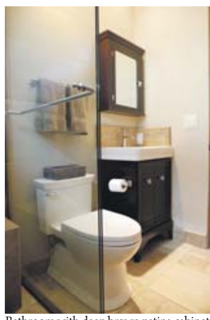
Bathroom with deep brown patina cabinet