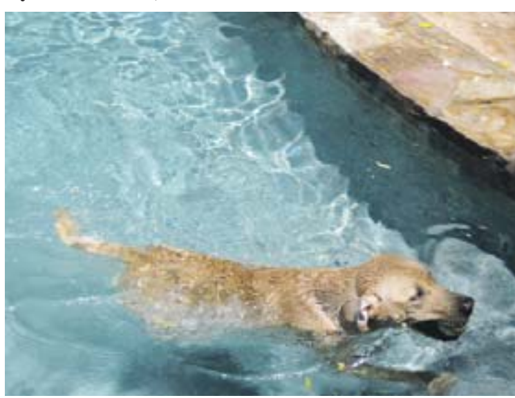
Mona Miller's one-year-old Labrador, Luca, stays cool in the pool on a hot day.