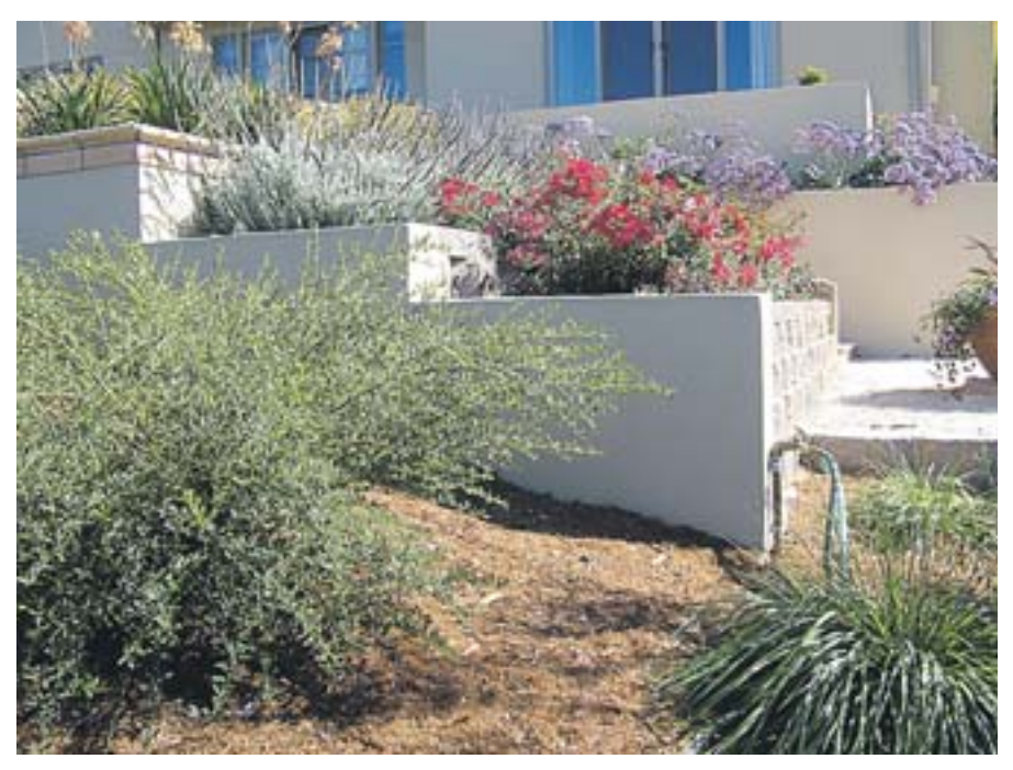
The red roses (fire) are balanced by the square planter (earth) that contains them and the green plants (wood) nearby