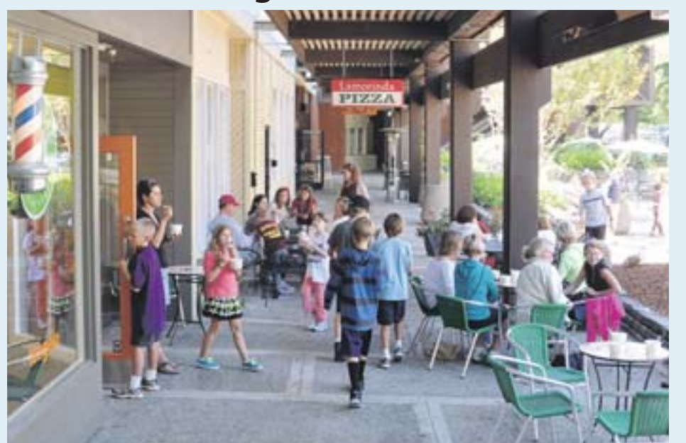
On the first day of school families enjoyed frozen yogurt from Tangelo, which recently opened at the Rheem Shopping Center.