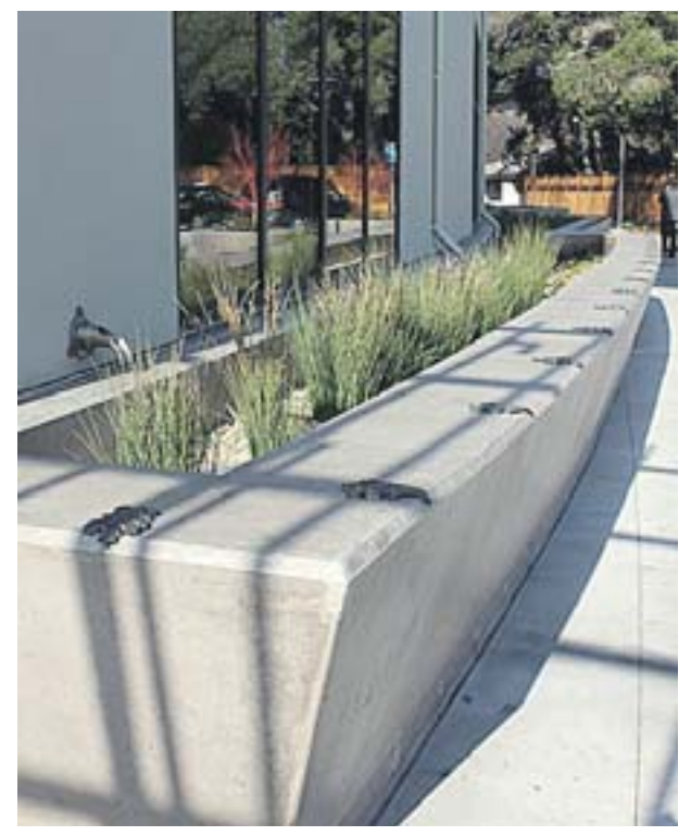
Water collecting planter at the Walnut Creek Library

"Homeowners, according to the new State requirement, will have different options to divert the flows and we are working on the detailed specifications," says Cathleen Terentieff, Orinda Associate Engineer/Stormwater Program Manager. The different options are to direct roof runoff into cisterns or rain barrels for reuse and onto vegetated areas; to direct runoff from sidewalks, walkways, and/or patios onto vegetated areas; and to construct sidewalks, walkways, and/or patios with permeable surfaces. In short, homeowners can collect water, divert it to planters or gardens, and/or construct their driveways with permeable material.