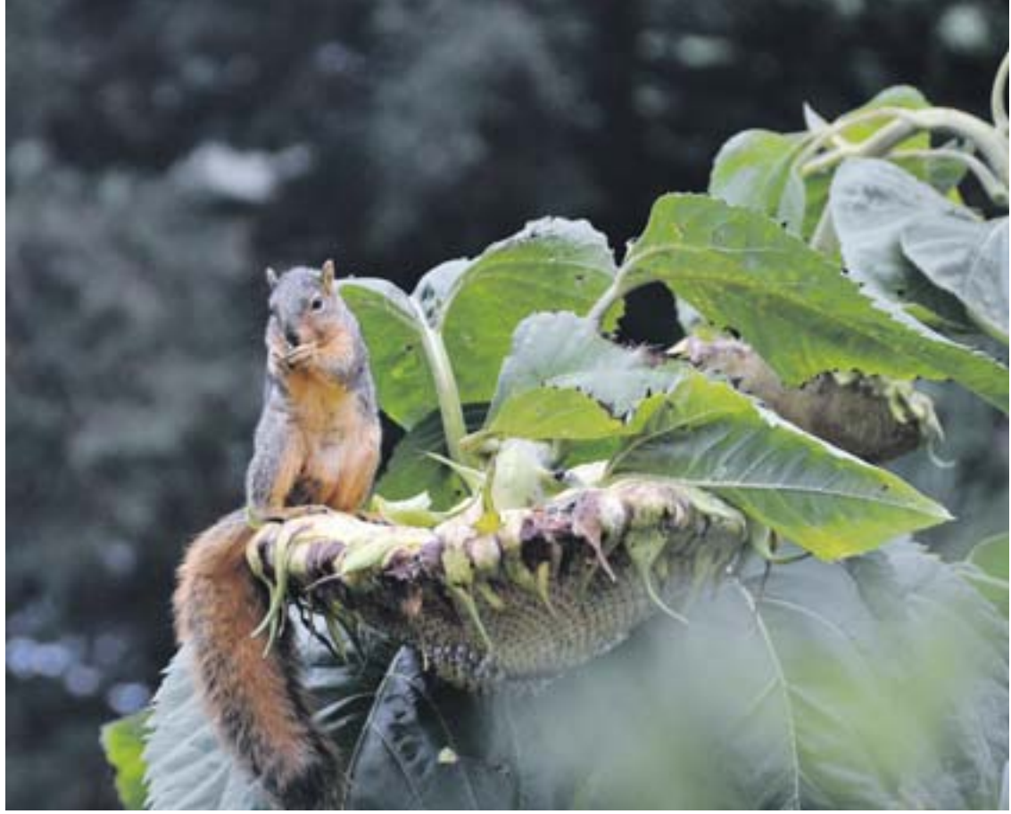
Breakfast on the sunflower balcony

"As I farm the soil which yields my food, I share creation. Kings can do no more." Chinese proverb