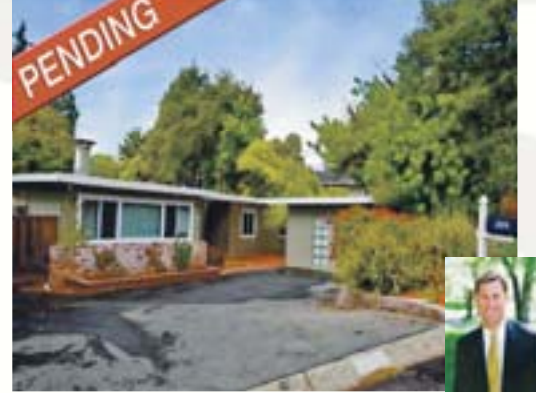
Lafayette ~ Lowest priced 3Bedroom home in town! Great, quiet neighborhood, Acalanes School Dist. Perfect starter home. Wood burning fireplace. Detached studio for many options.

Tim Shields 925.457.2222 soldbytim@gmail.com