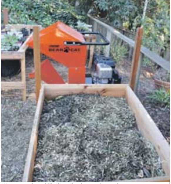
Compost bin filled with chipped garden waste

Cynthia: Can you explain how you compost?