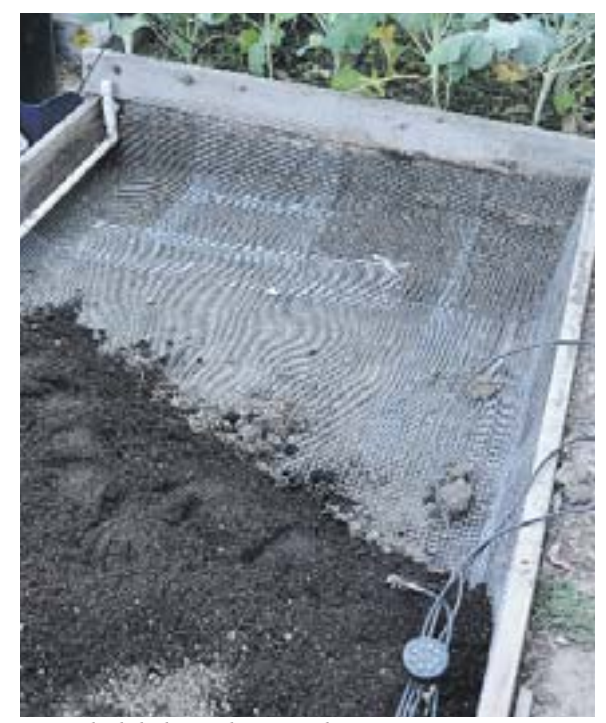
Wire cloth helps to keep gophers out

the plants clean and disease free. If a leaf turns brown, I cut it off. Lots of sunshine and air circulation are key to success. My gopher barrier has also been successful because gophers are smart. It's important that every corner is wired. We harvested over 200 pounds of tomatoes this season and we've been eating them from July through November. There is nothing better than this!