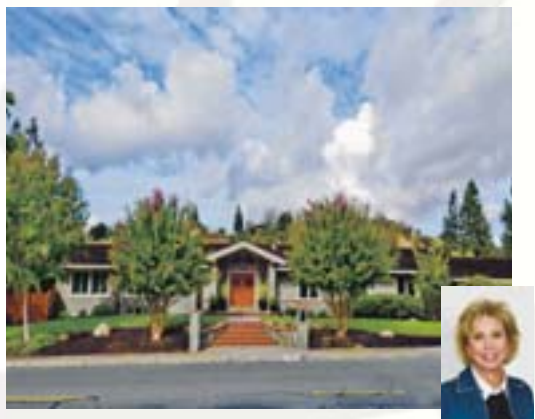
Alamo ~ Wonderful remodeled 5/3 single story 2800+ sf home with separate den plus office. Kitchen open to family room w/cozy fireplace. Private backyard w/pool & spa! Walk to 12 years of top ranked schools! $1,150,000

Gretchen Bryce 925.683.2477 Gretchenbryce.com