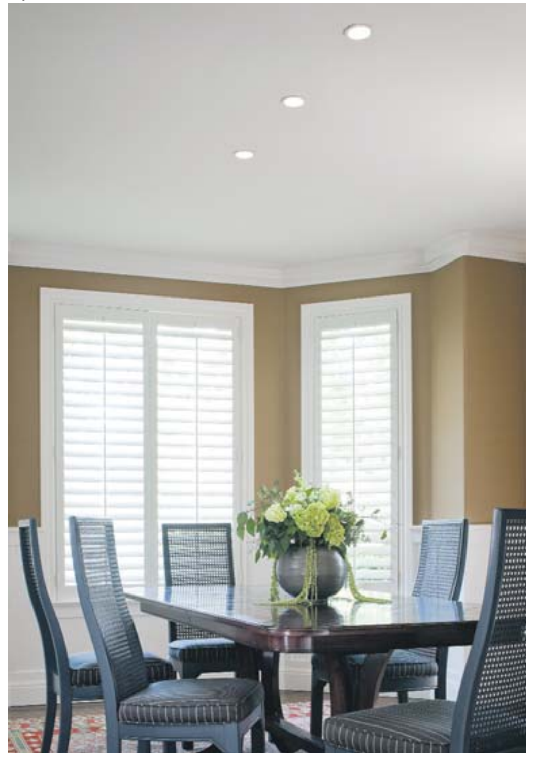
The Moraga dining room, featured on ivillage, includes a custom dining table, vintage re-purposed chairs, menswear upholstered seats, new lighting, smooth textured walls and custom colored paint, designed by Ann McDonald, Couture Chateauwww.couturechateau.com

hen setting out to complete a transitional suburban redesign for two stylish Moraga homeowners, my design team took some color risk so the space would feel fresh. We said goodbye to beige, hello to gray.