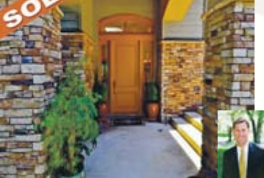
Lafayette ~ Custom designed home w/3,517 sf is set among 27 Oaks w/unparalleled views of Lafayette & W/C. 3 gas fireplaces, granite countertops in gourmet kitchen, Au Pair/office, inset ceiling & crown moulding, Luxurious Master Suite & more!

Tim Shields 925.457.2222 soldbytim@gmail.com