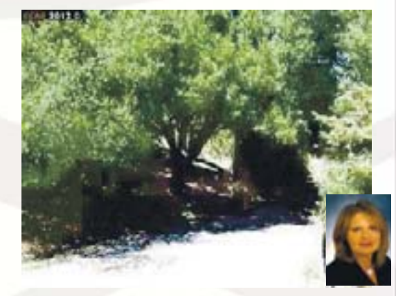
Orinda ~ Lovely upslope lot in terrific neighborhood of impressive homes, close to downtown Orinda, BART, and schools! Wonderful opportunity to build your dreamhome! $220,000

Vicky Van Brocklin 925.785.6380 Vicky@vickyvanbrocklin.com