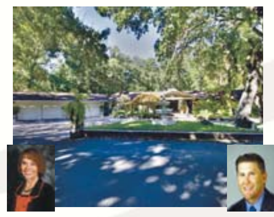
Alamo ~ Fabulous 1 level creek side estate in oak studded park-like setting. Almost 1 acre w/1000 sf guest house, pool & Koi pond. Home is approx 3973 sf & exquisitely remodeled throughout. $1,575,000

Gretchen Bryce 925.683.2477 Gretchenbryce.com