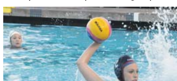
Campo hosts a determined #4 Miramonte in the semifinals. The Cougars defeated the Mats both times they faced off this season.