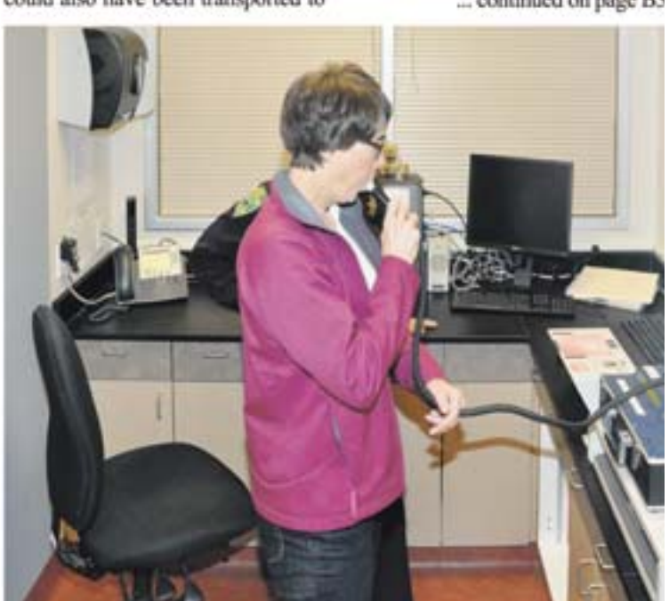
A second breath test is performed at the Moraga Police Department.