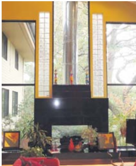
Dramatic window wall surrounding the Schlinkert's living room fireplace.

African adventures. In 1982, the prior owner installed the striking black granite fireplace as well as the built-in TV and audio niche in rich dark stained cherry.