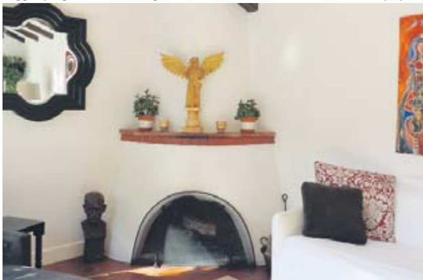
Kiva style, Kangeter family.

From a senior apartment to stately hillside estate to an historic ranch home, and beyond, it's not unusual to own a fireplace – or two – in this neck of the woods. In a completely random sampling of fireplace styles, Lamorinda residents opened their doors to share their unique fireplaces from kiva style, to a pellet stove, to a see-through model that truly brings the outdoors in.