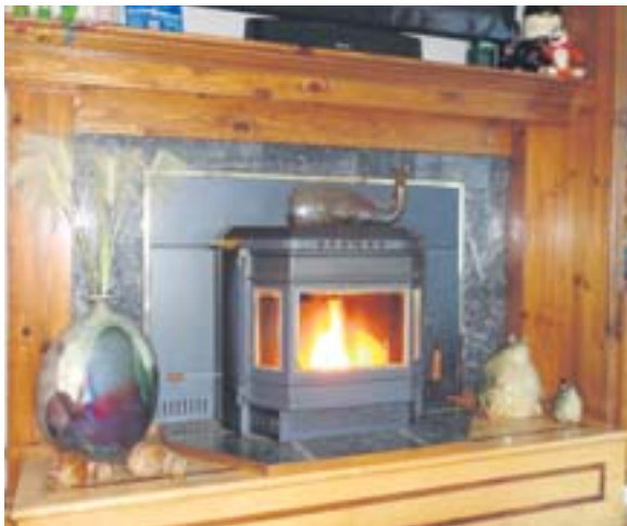
Very efficient pellet stove at the Hamm's house.

Pellets burn cleaner and more efficiently than conventional logs, and leave less ash to clean up. Their model has a handy automatic pellet feeder and adjustable blower to control the temperature, and on top sits a whale-shaped container that, when filled with water and heated, pushes steam out of its blowhole – an instant humidifier. With a large comfy couch, big screen TV and built-in bookcases, their family room couldn't be more inviting.