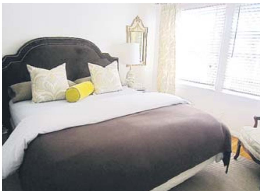
Fresh sheets and an extra blanket make for a welcoming guest room.

I often say that life is short - fleeting and ignored by most. Sharing beautiful moments and providing comfort to those that you care about is your legacy. You have a choice to either go through your life like the masses, or to create your own experience for yourself and those you love - choose wisely.