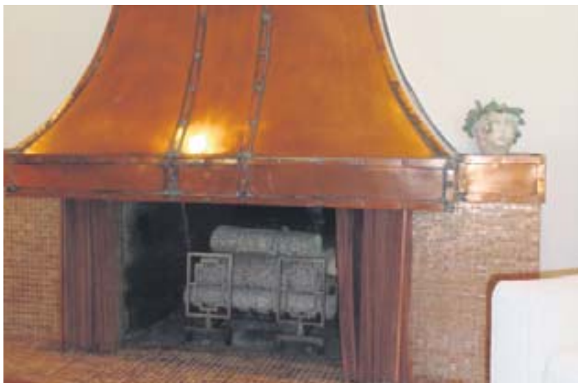
Copper fireplace at the Kangeter home.