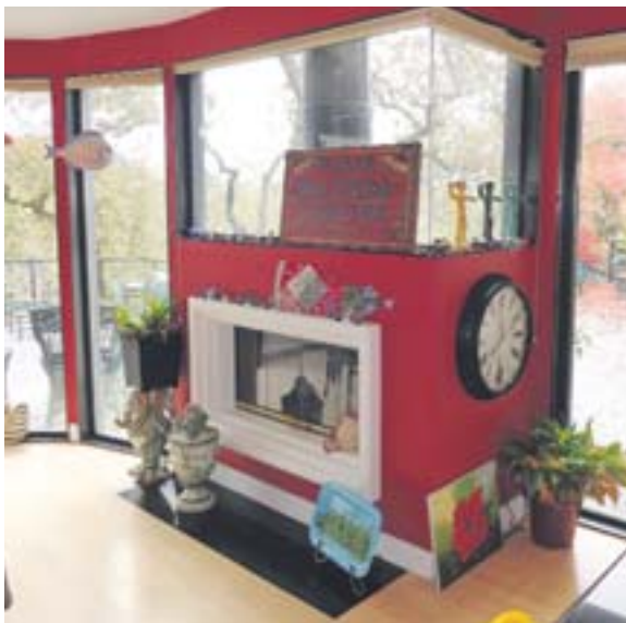
Fireplace in the Schlinkert's breakfast room.