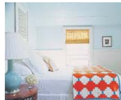
Just a few amenities make your friends and family feel pampered

Keep an extra toothbrush, razor and hair dryer within reach - travelers tend to forget the simple things, and your thoughtfulness will not go unnoticed. Place your guest's shower and hand towels out - I suggest a different