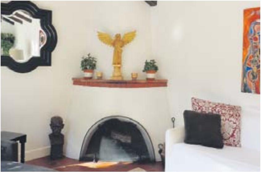
Kiva style, Kangeter family.

rom a senior apartment to stately hillside estate to an historic ranch home, and beyond, it's not unusual to own a fireplace – or two – in this neck of the woods. In a completely random sampling of fireplace styles, Lamorinda residents opened their doors to share their unique fireplaces from kiva style, to a pellet stove, to a see-through model that truly brings the outdoors in.