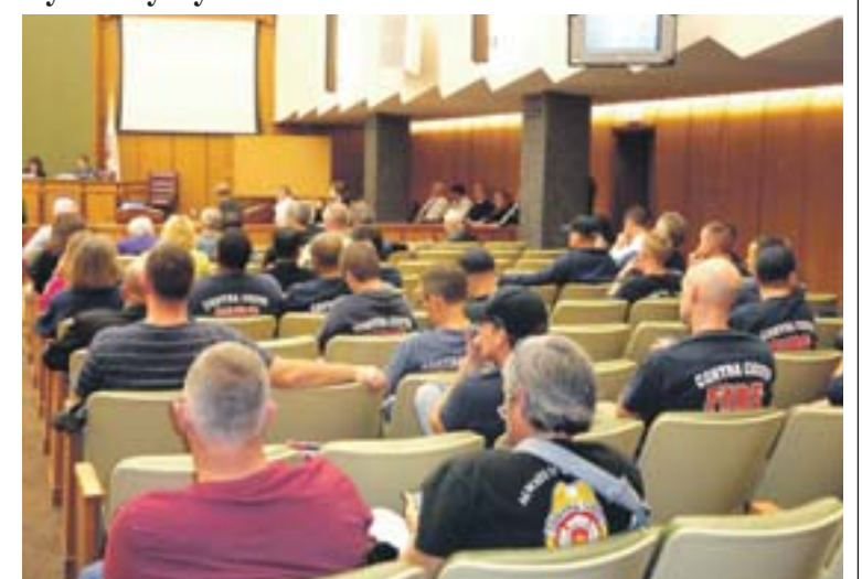
Off-duty firefighters packed the County Board of Supervisors auditorium to hear the final decision on station closures.