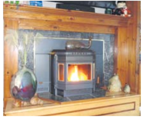
Very efficient pellet stove at the Hamm's house.

Pellets burn cleaner and more efficiently than conventional logs, and leave less ash to clean up. Their model has a handy automatic pellet feeder and adjustable blower to control the temperature, and on top sits a whale-shaped container that, when filled with water and heated, pushes steam out of its blowhole – an instant humidifier. With a large comfy couch, big screen TV and built-in bookcases, their family room couldn't be more inviting.