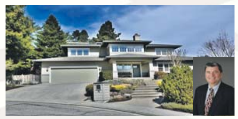
Moraga ~ Craftsman Custom Home with 2490 sq. ft. and many energy efficient elements. The 1.29 Acres offers a private site with a home offering a host of amenities. Only 1block to High School. Priced to Sell! $1,150,000

Danville ~ Wonderful updated 4 Bdrm, 2.5 Bath home with over 2700 sq ft. Walking distance to 12 years of top ranked schools. Large kitchen with huge center island perfect for entertaining. Hardwood floors, crown moulding, dual pane windows. Private backyard w/pool and built in bar-be-que. $1,149,000