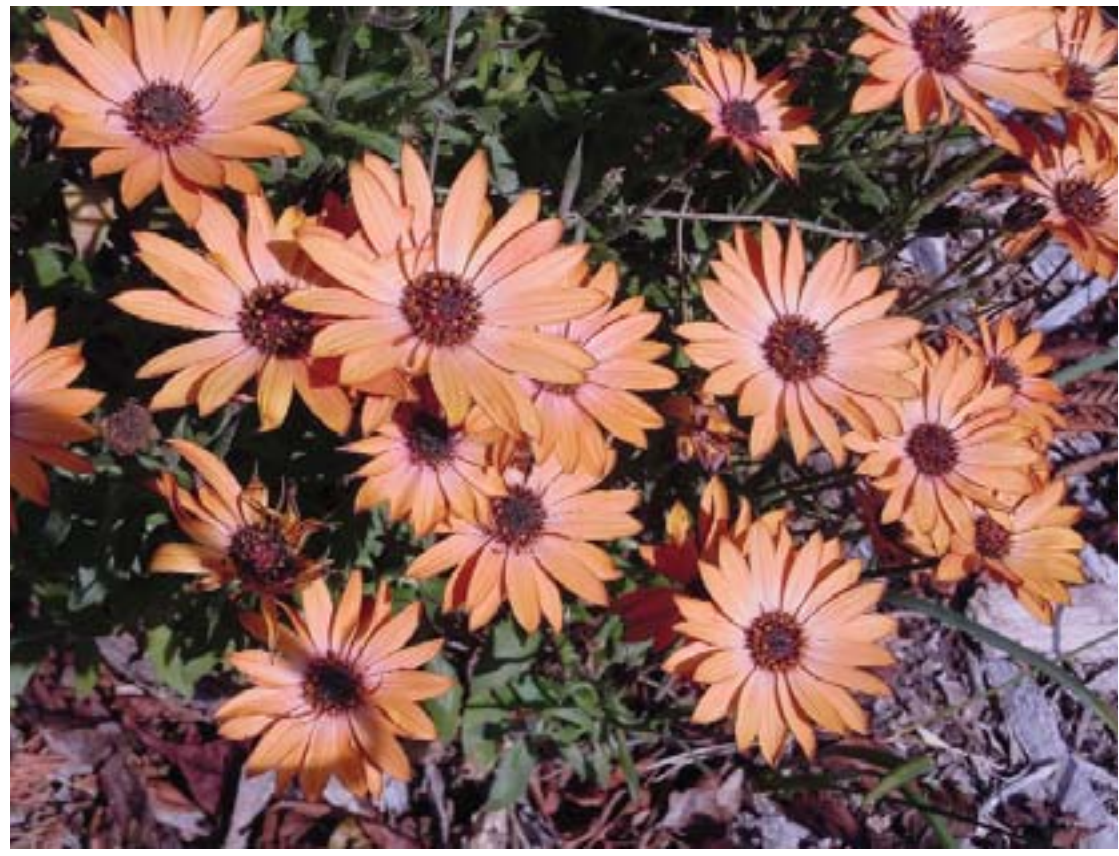
Tangerine-colored osteospermum is a pollinator plant.

Agastache Amaranth Cleome Dahlia Marigold Salvia Sunflower Zinnia