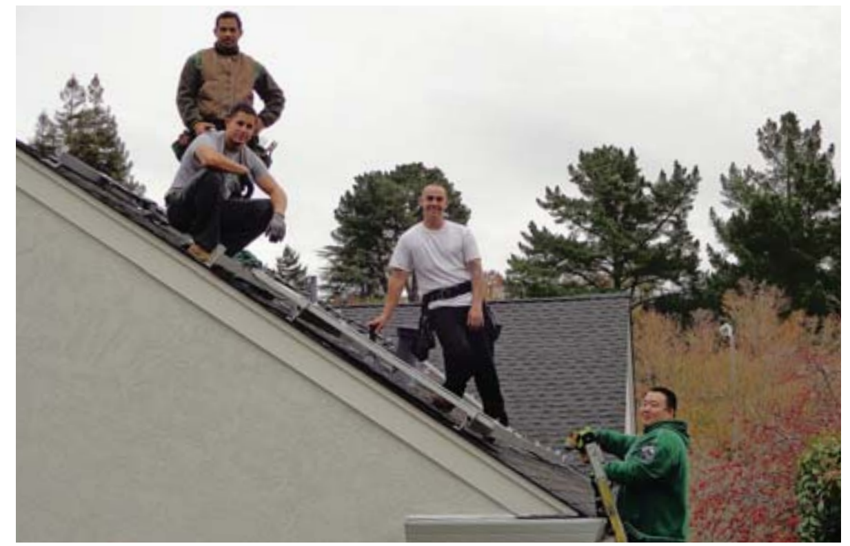
A local solar company installs, monitors, and finances residential and commercial energy systems. They are licensed to install, maintain and repair solar energy systems and for heating, ventilating and air conditioning. Some of the crew are pictured installing panels on a home in Moraga.

do not complete the work, you will have to pay to finish it, even if you've already paid the contractor. ... continued on next page