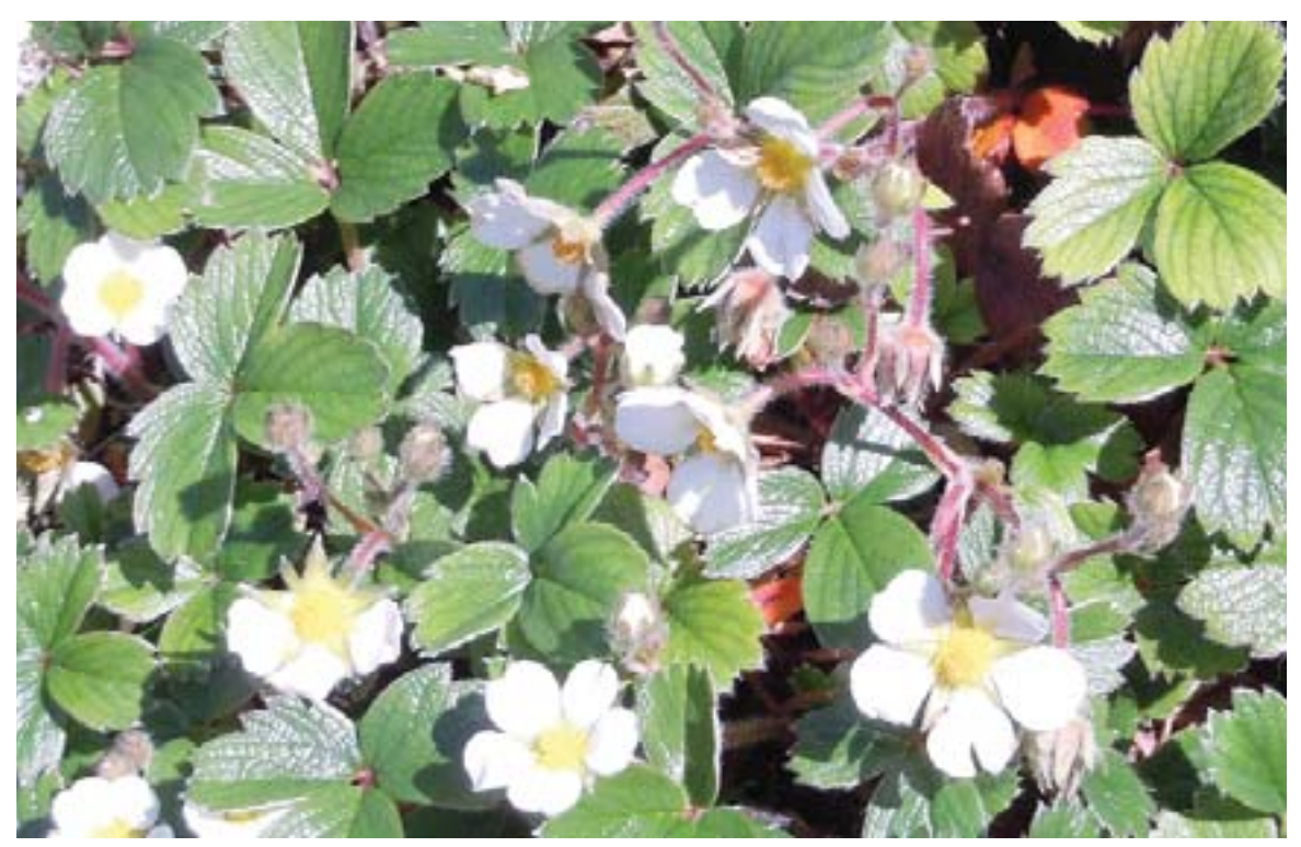
The flowers of the strawberry plant herald juicy fruits to come.