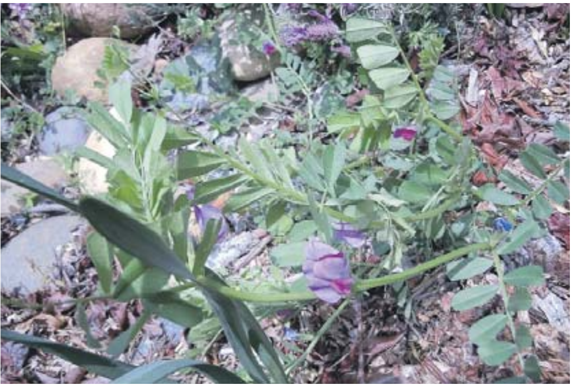
It's time to till the vetch cover crop into your soil to add nutrients.