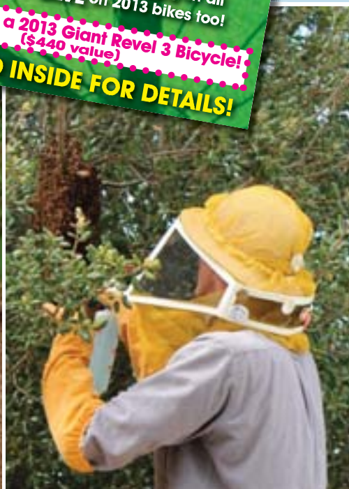
Removing the bee swarm Photo provided