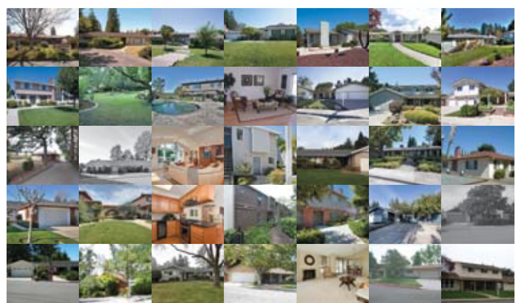
JUST A FEW OF MY CLOSED SALES...