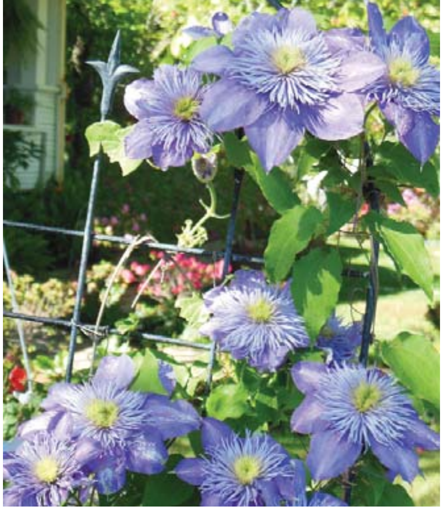
Ice blue clematis is a vertical climber.