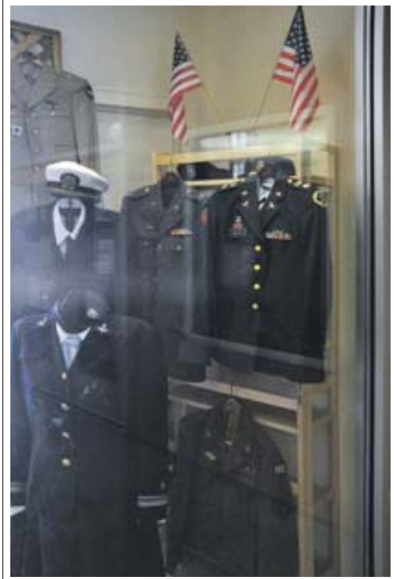
The Orinda Historical Society Museum's display window showcases military uniforms and war memorabilia.

orld War II. Korea. Vietnam. Desert Storm. America's response to 9/11. They live quietly among us - men and women who answered the call at times when our nation and world needed unparalleled strength of character and wisdom - the soldiers, avia-