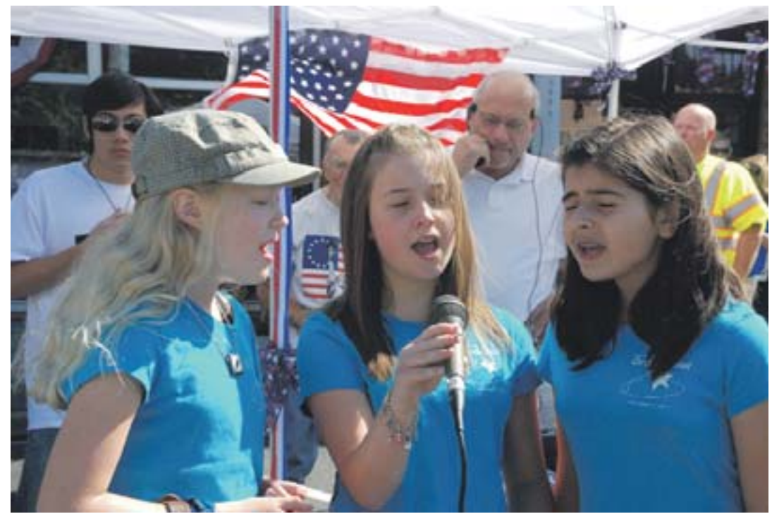
Orinda Idol performers at last year's Fourth of July celebration.

amorinda Idol 2013 Finalists will be performing at a series of summer performances leading up to the Lamorinda Idol Finals scheduled Sept. 8. Check out these talented kids as they perform as soloists and groups at a variety of venues on the following dates: July 4 from 9 to 11:30 a.m. the Lamorinda Idol float will feature former winners and some of this year's finalists during the Lamorinda 4th of July Parade; July 16, singers will take the stage at 6:15 p.m. following the EFO jazz band performance at the Orinda Community Park during the Orinda Arts Council Arts in Bloom festival; July 28 at 2:45 Lamorinda Idol singers will perform at the Lafayette Reservoir Stage Concert as well as on Aug. 24 from 2:45 to 5 p.m. during the Orinda Theatre Square Concert. For a full schedule of performances, visit www.orindaartscouncil.org. J. Wake