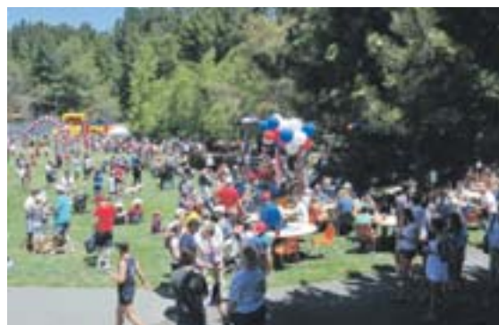
Celebration at the Orinda Community Park last year