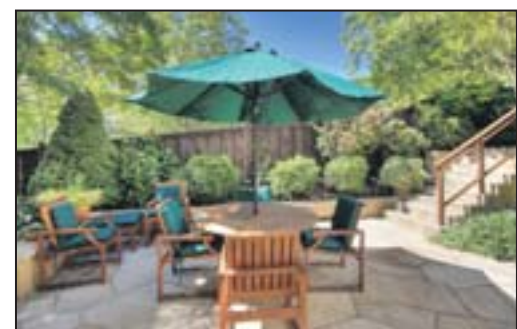
1903 Saint Andrews Drive, Moraga

This stunning, beautifully updated home boasts quality throughout. Spacious 3 bedroom, 2.5 bath floor plan boasting approximately 3,424 square feet with built-ins, vaulted ceilings, hardwood floors, and gourmet kitchen. Luxurious Master Suite with fireplace and private balcony. Additional family room/office. Abundant natural light and walls of glass throughout offering views of the surrounding hills and gorgeous landscaped backyard. Truly an entertainer's