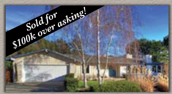
1908 Joseph Drive, Moraga

Incredible .66 acre offering private park-like yard. This 4 bdrm, 3 bath home offers a remodeled kitchen plus a bonus recroom and is located in Moraga Bluff's neighborhood and offers a great setting for entertaining.