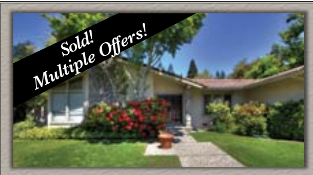
30 San Pablo Court, Moraga

Melon flies prefer tomatoes, Mexican fruit flies like citrus and guavas, and fruit flies in general like peaches, apricots and nectarines. Mediterranean fruit flies will eat ripe olives, which is how this writer came to have her very own bug trap placed among the branches of a front yard olive tree. ... continued on next page