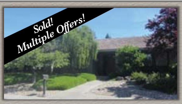
279 Claudia Court, Moraga

Attractive Moraga home has been updated by original owner offering 5 bdrms plus bonus game room with 3 full baths. The home offers large living, dining and family room and updated kitchen. Views of Mt. Diablo and surrounding hills.