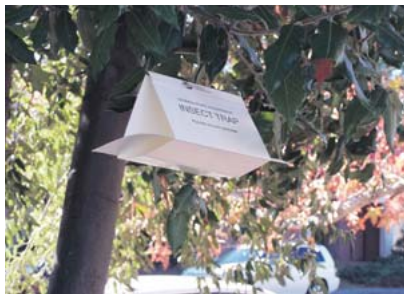
Local residents are notified when traps are being placed on their property.

ummer for Lamorindans means warm weather, an abundance of ripening backyard fruit and plentiful travel opportunities. That is as true for fruit fly pests as it is for the human residents, which is why you may see bug traps in your neighborhood trees.