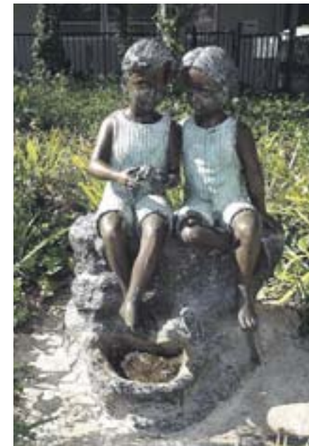
A Burton Valley Elementary School statue seems to capture the essence of a child's summer.

The Lafayette Historical Society recently hosted a presentation on the Sacramento Northern railroad line. More photos are available online at www.eastbayhillsproject.org .