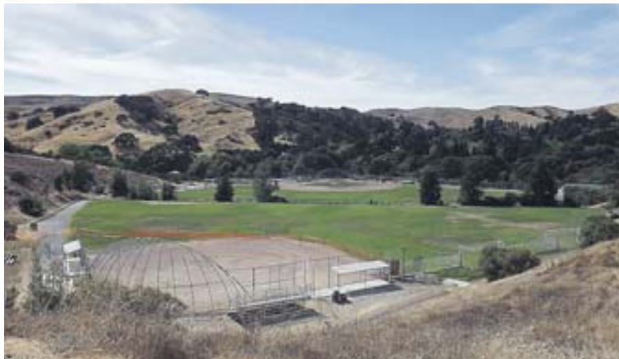
Lafayette Community Park