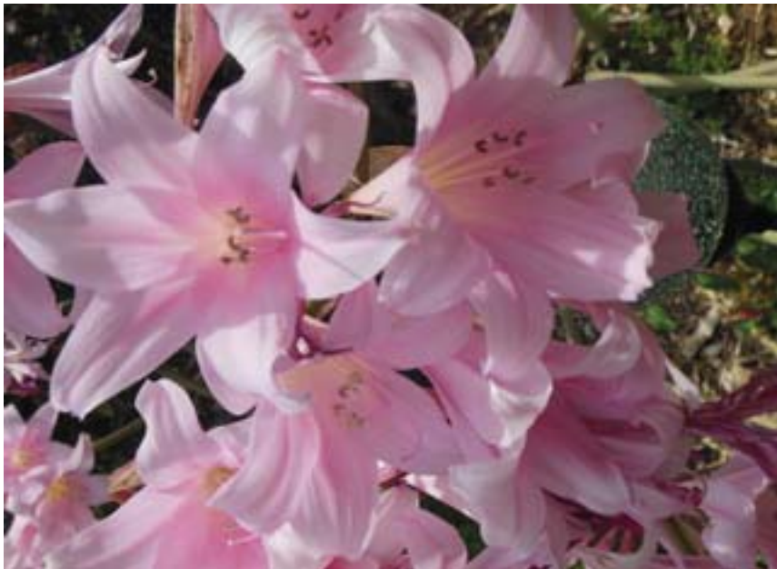
Close up of the Magic Lily

"To see you naked is to recall the Earth." Federico Lorca Garcia, Spanish Poet