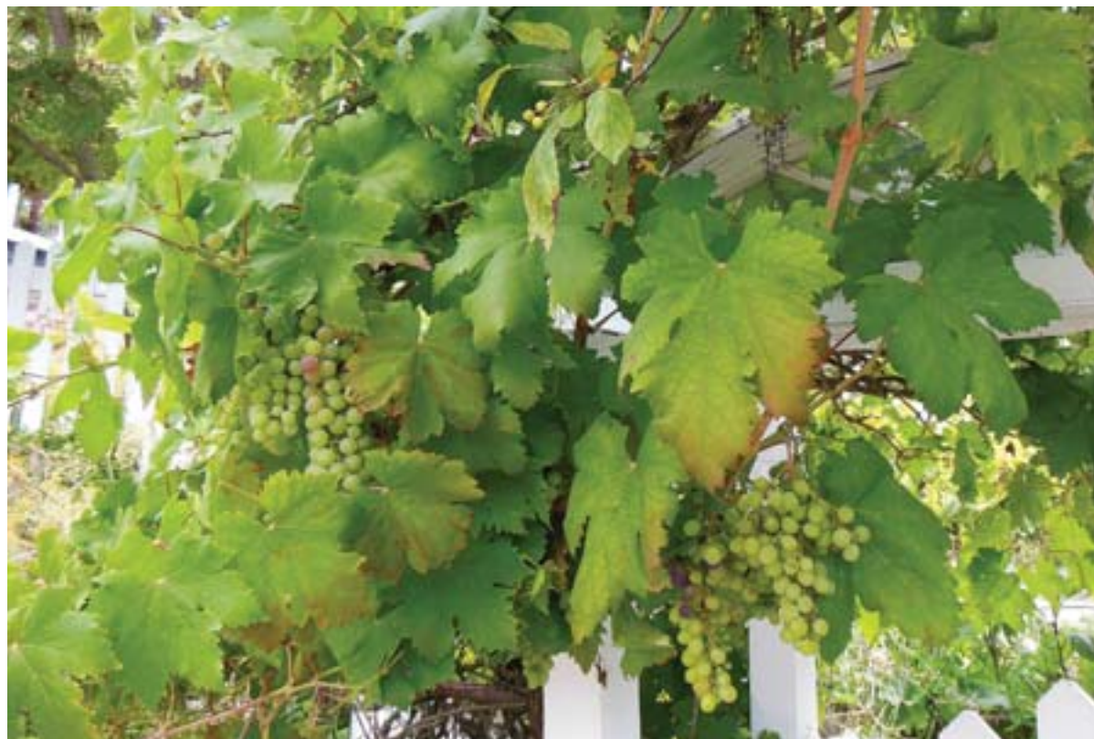
Grapes, missed by the deer, are beginning to show color on the arbor.