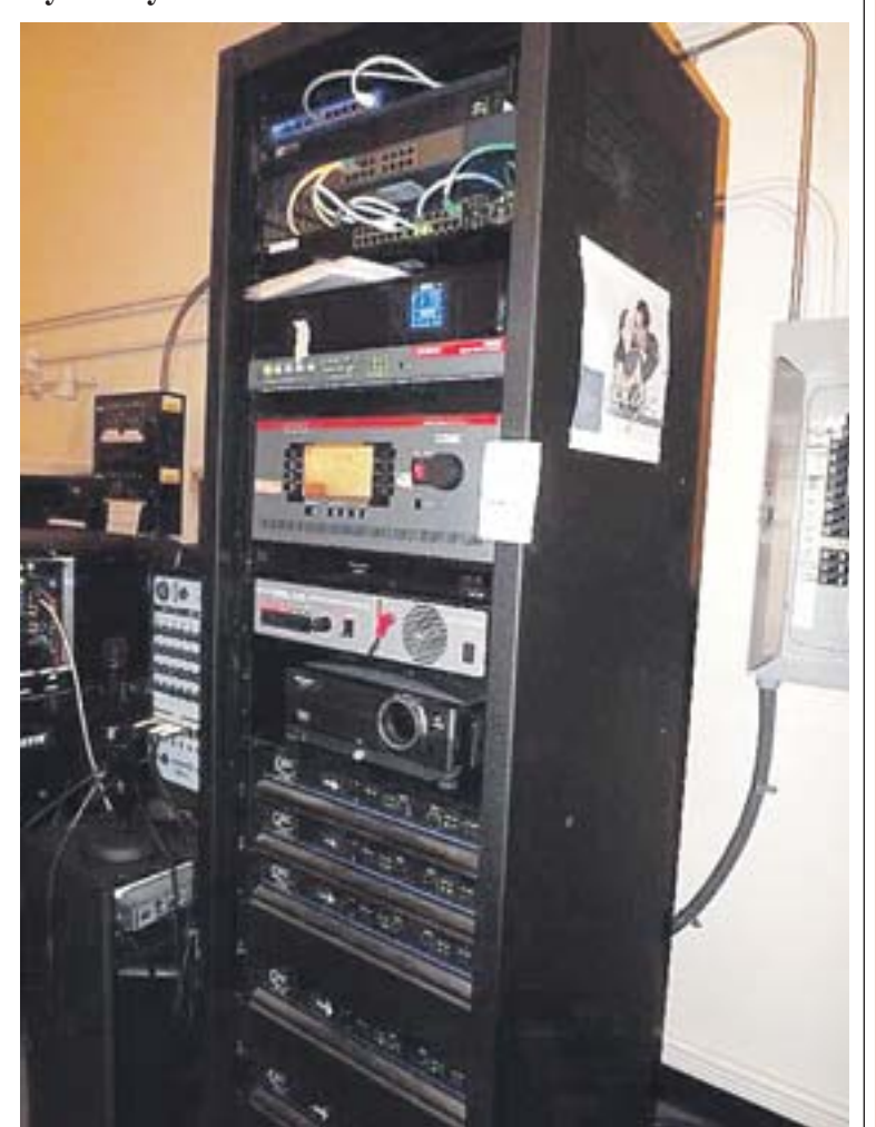
Digital sound equipment at the Rheem.