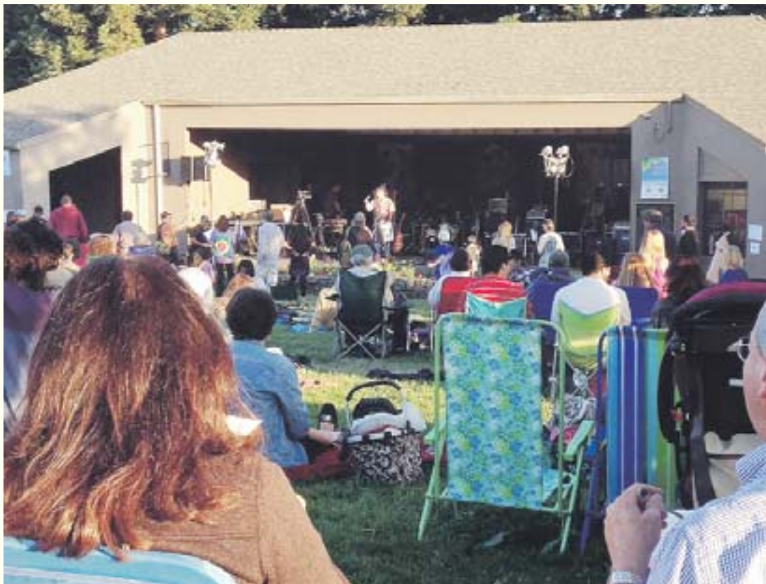
Moonalice concert at the Moraga Commons