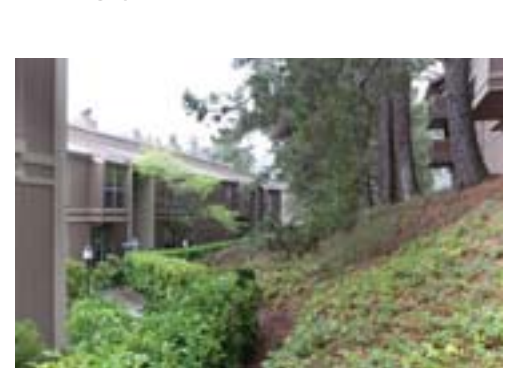
COMPLETELY REMODELED! 2055 Ascot Drive #107, Moraga 2BR/1BA, 1068± sq. ft. Offered at $325,000