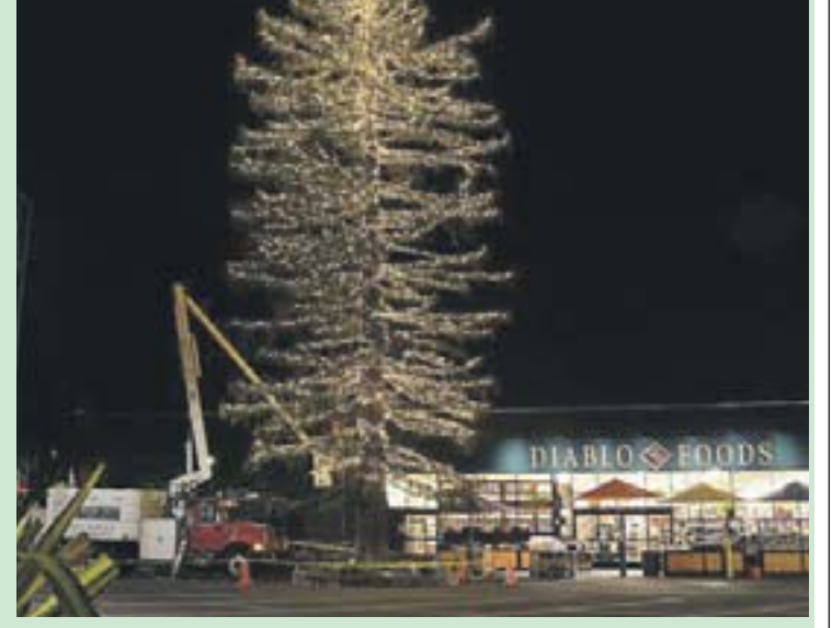
Residents admired beautifully lit branches after crews finished installing lights on the Diablo Foods tree in Lafayette Sept. 17.