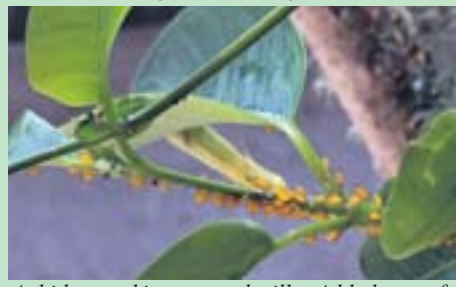
Aphids attacking a mandevilla. Add cloves of garlic or spray with soap.