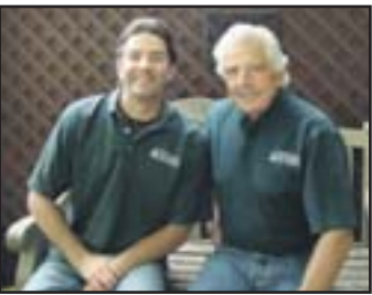
Family owned in Moraga since 1987