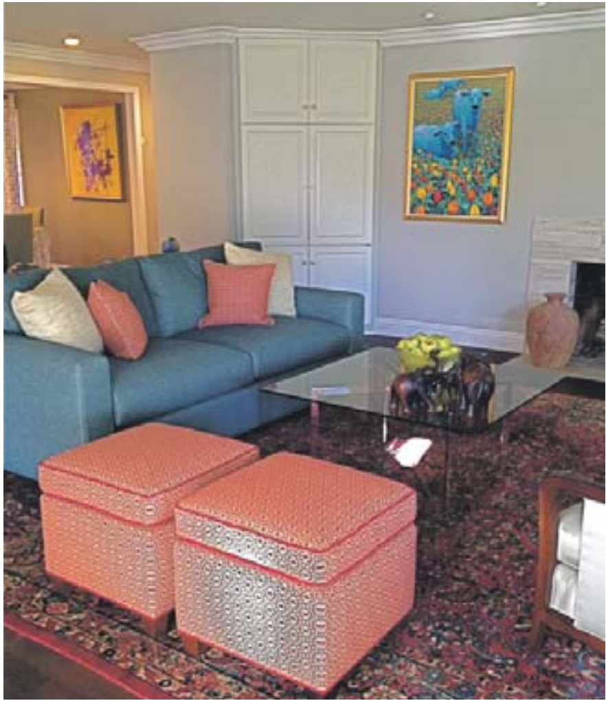
After – sleek new walls over old brick combined with glossy white crown moulding create a new polish to the room.