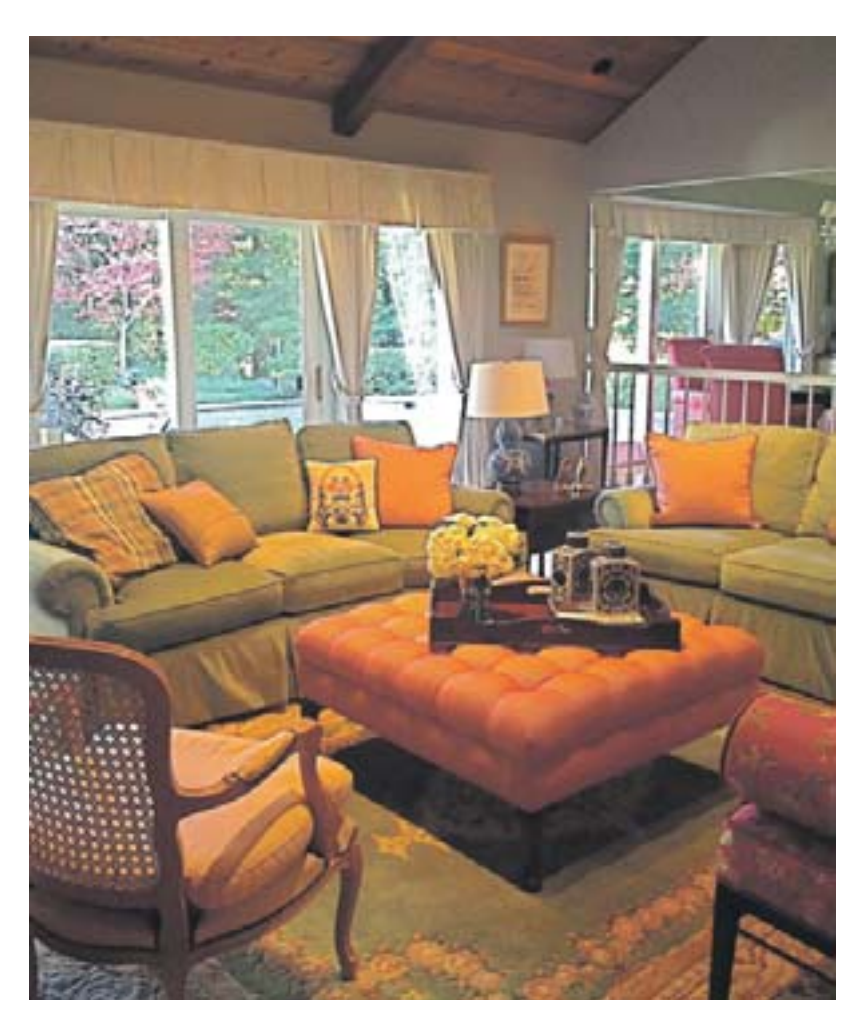
An oversized ottoman does double duty as a place for snacks and extra seating in a pinch.

Don't be afraid to mix metals. Layering brass, silver, and even chrome can add interest and keep everything from looking too staged.