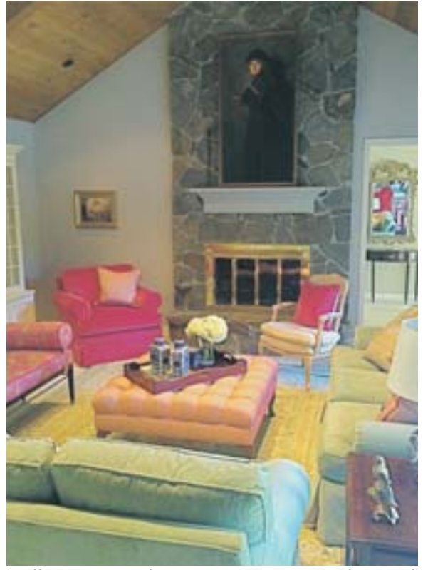
Walls were painted a custom grey to accent the grand fireplace stone.

ave you ever entered a room and instantly felt your spirit lifted? Or, driven past a field of flowers and been transported? That's the power of color. Sure, we all have different preferences when it comes to color – some cooler, some warm and enveloping. Many studies have been done on the psychology of the way color impacts us, but the bottom line is we like what we like. Color is visceral – it transforms.