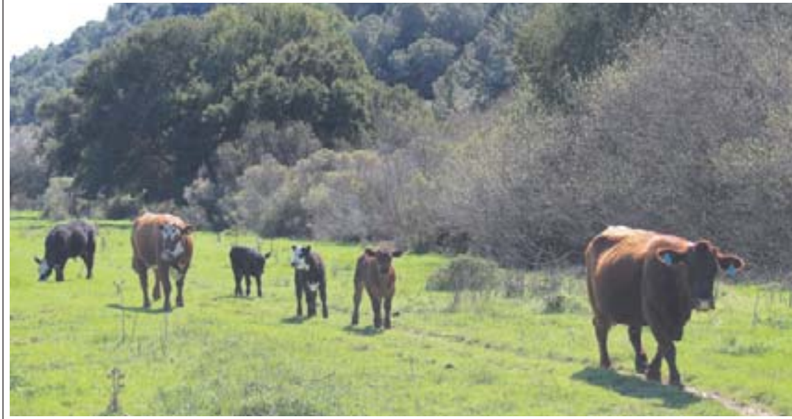
Cattle walk along a trail beside Grass Valley Creek, a tributary of San Leandro Creek and part of the watershed.