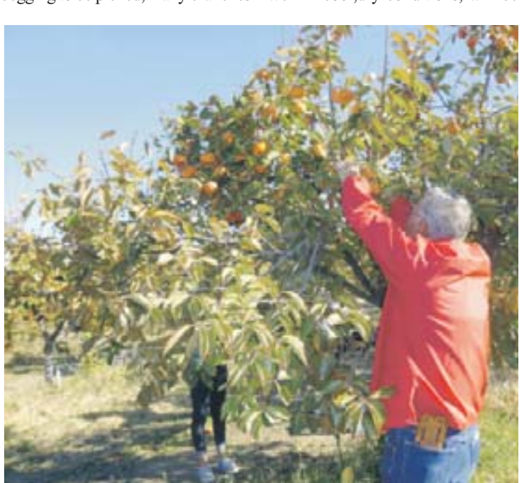
Volunteers pick persimmons.

The volunteers stopped picking objective was reached. "That's all the