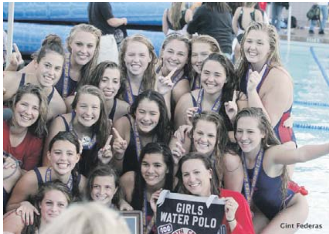
Campolindo Girls' Water Polo wins the NCS Championship for the third time in four years.