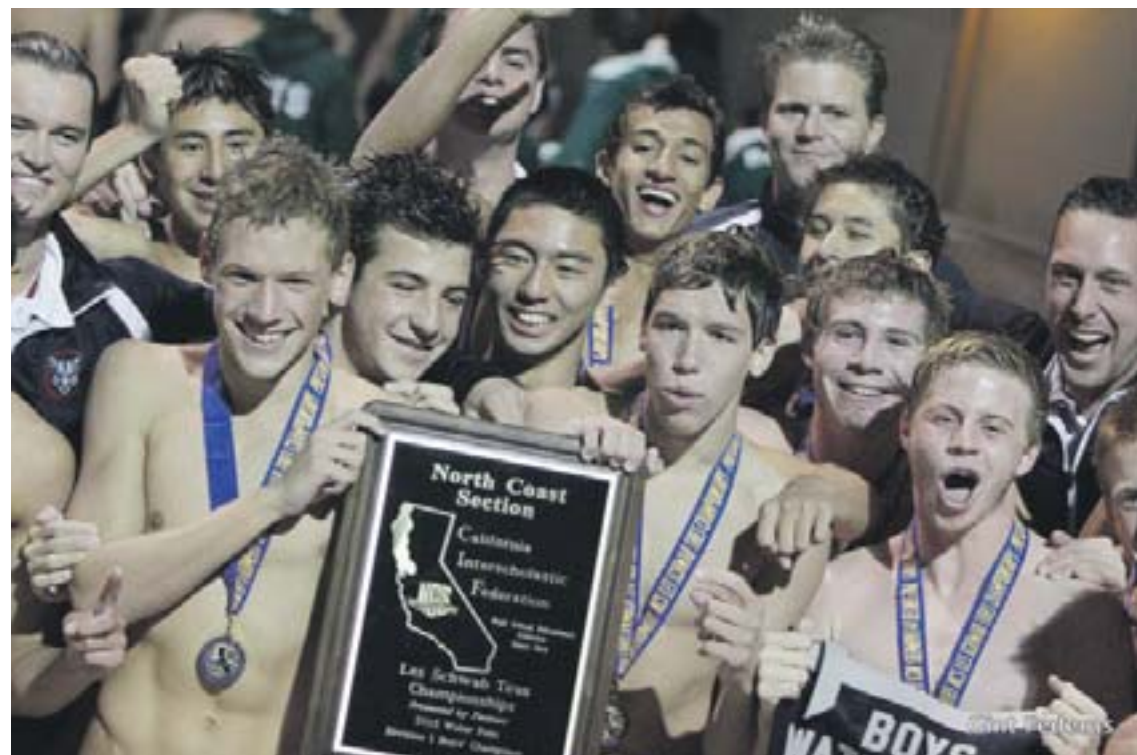
Campolindo Boys' Water Polo wins its first NCS Championship.