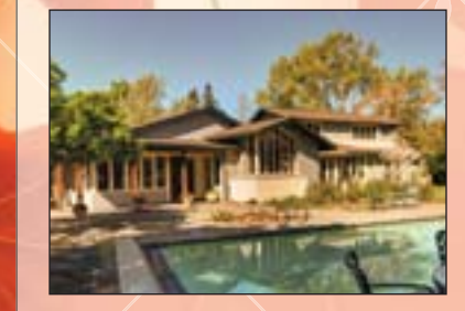
660 LOS PALOS DRIVE 5 BR/4 bath modern craftsman in Burton Valley sold in 10 days with 3 offers over asking at $1,775,000.