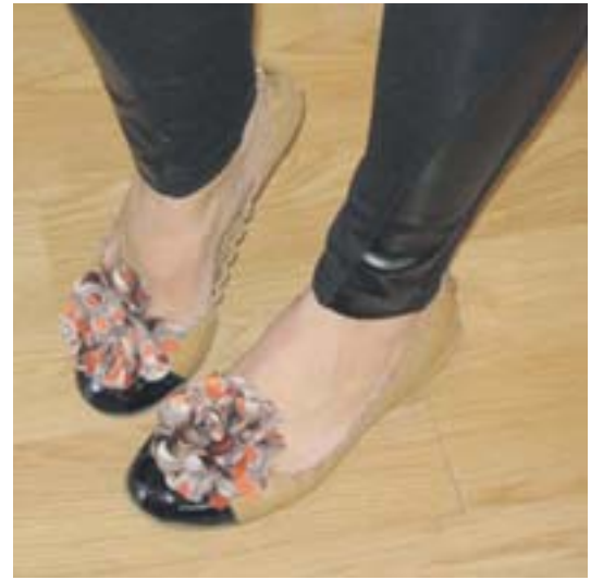
Silk floral shoe clips