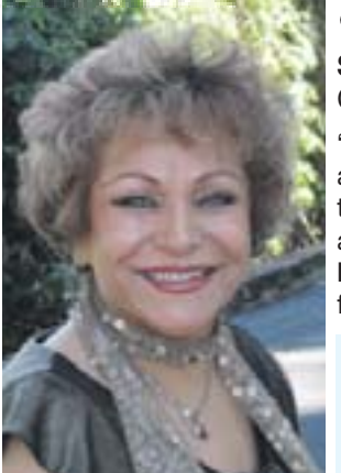
Providing the best European hair care in Lamorinda!

Over 23 years serving Lamorinda. Specializing in: Precision Cut, Style, Color & Perms, Women, Men, Children