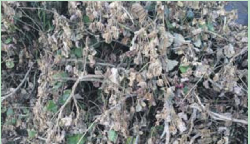
Geraniums look sad after the freeze. Once they are pruned in March, they return to their normal splendor.