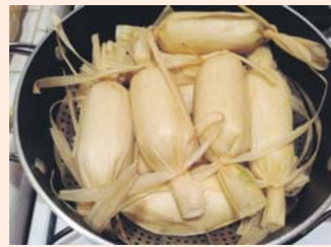
Ready to serve