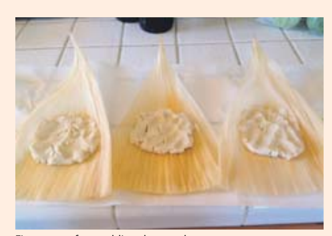
First stage of assembling the tamales