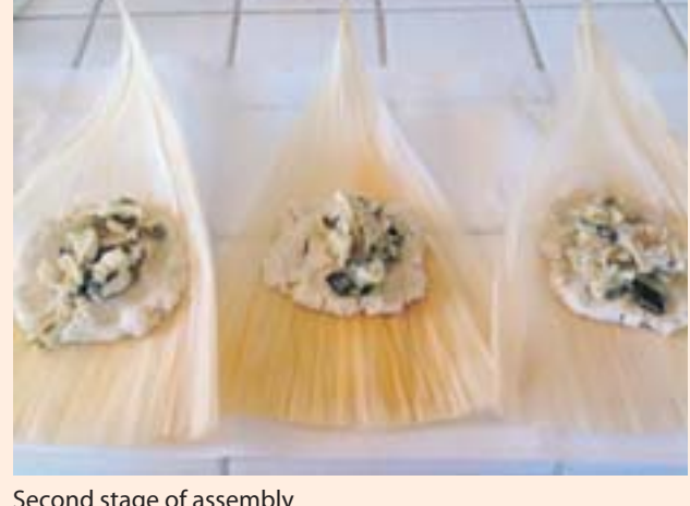
Second stage of assembly