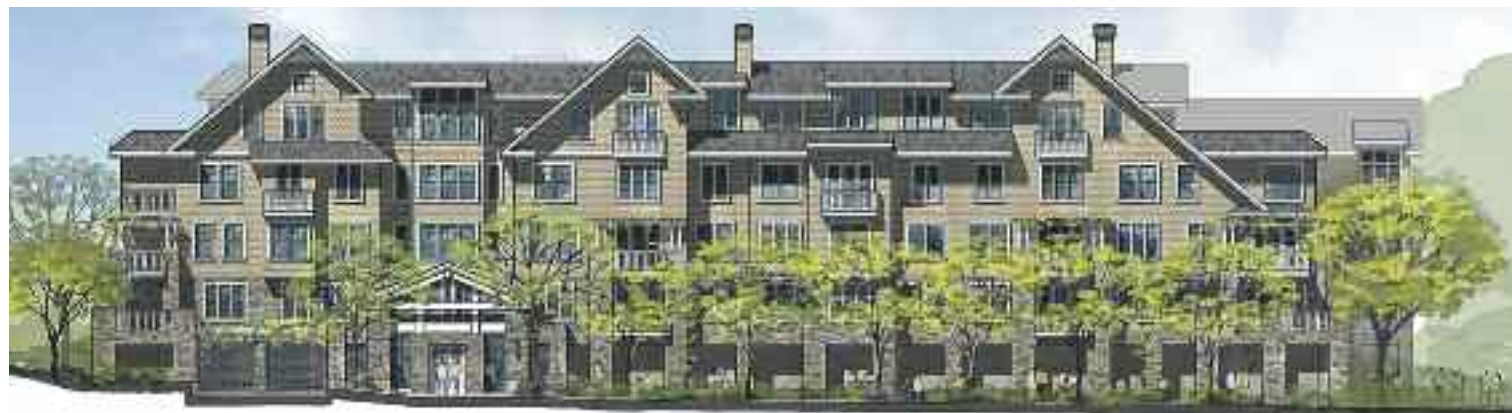
Rendering of the south elevation, Lafayette Town Center Phase III.