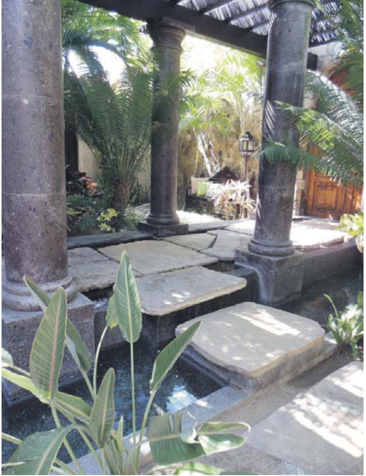
This cycad at the Ruth Bancroft Garden thrives in dry conditions. (Encephalartos horridus)

"Spring is nature's way of saying, 'Let's party!" – Robin Williams