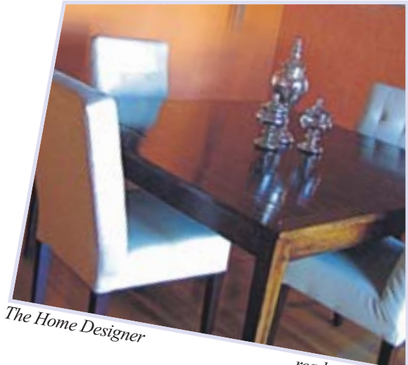
...read on page E8