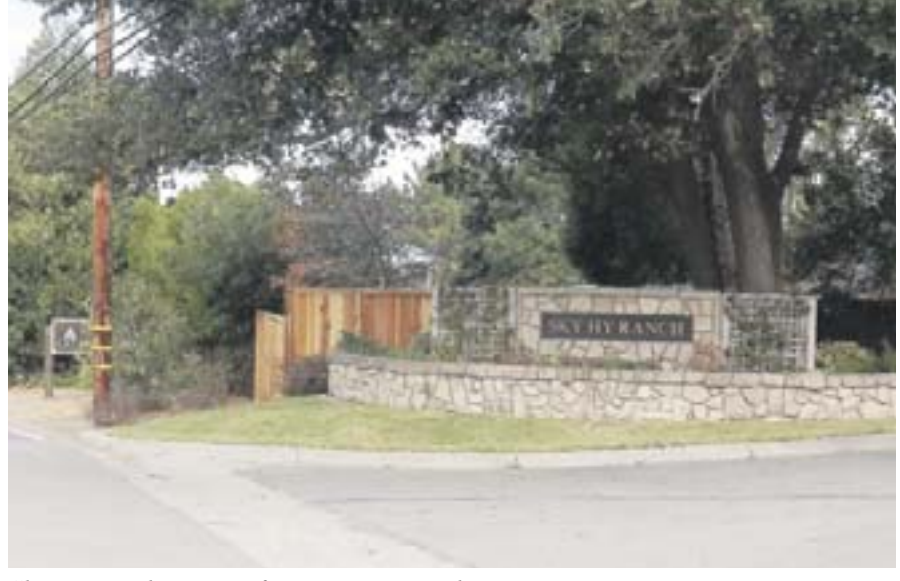
Sky Hy Ranch, as seen from Moraga Road.