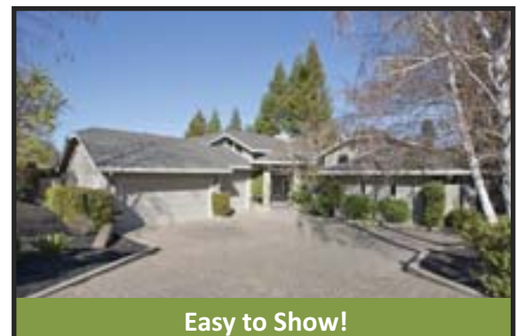
1812 Newcastle Court, Walnut Creek Offered at $1,965,000 1812NewcastleCourt.com

1985 Marion Court, Lafayette Offered at $2,345,000 1985MarionCt.com