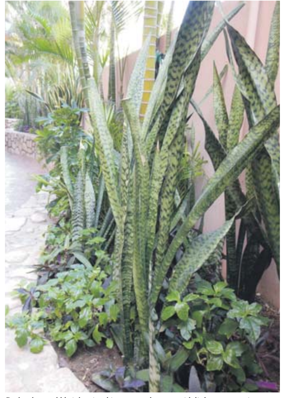
Snake plants add height, visual interest, and texture with little water requirements.

We could decide to turn off the spigot but allowing our gardens to go dry will have negative ramifications including loss of property values, increased heat around our homes, physical and psychological health benefit reductions, loss of recreational activities, decreased air quality, and a larger carbon footprint as we stop growing edibles in our backyards. Since we can't change the weather, we need to change how we respond to it. In my two-part series, I offer my suggestions to help your garden survive the impending dry season without a water bill that breaks the bank.