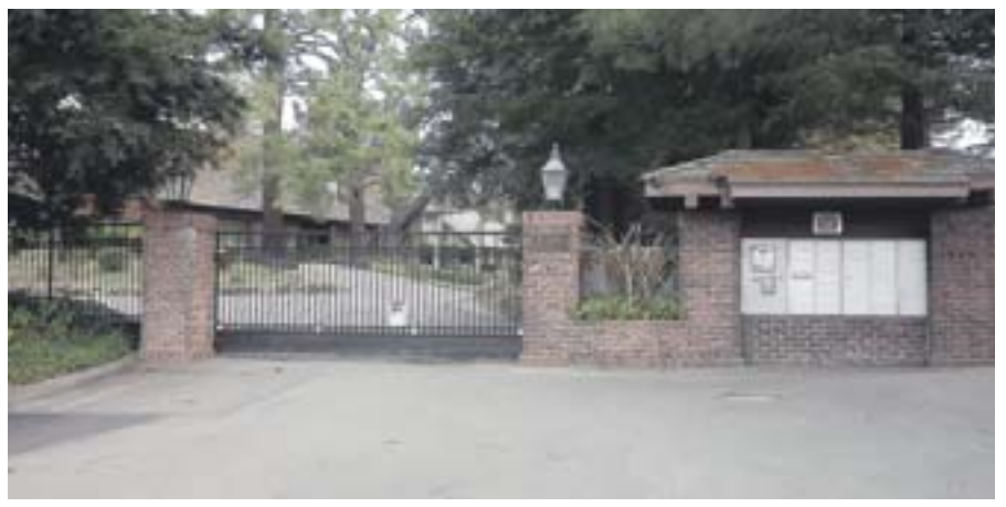
Sky Hy residents straddle the hillside between Lafavette and Moraga. Its high school students attend Campolindo.