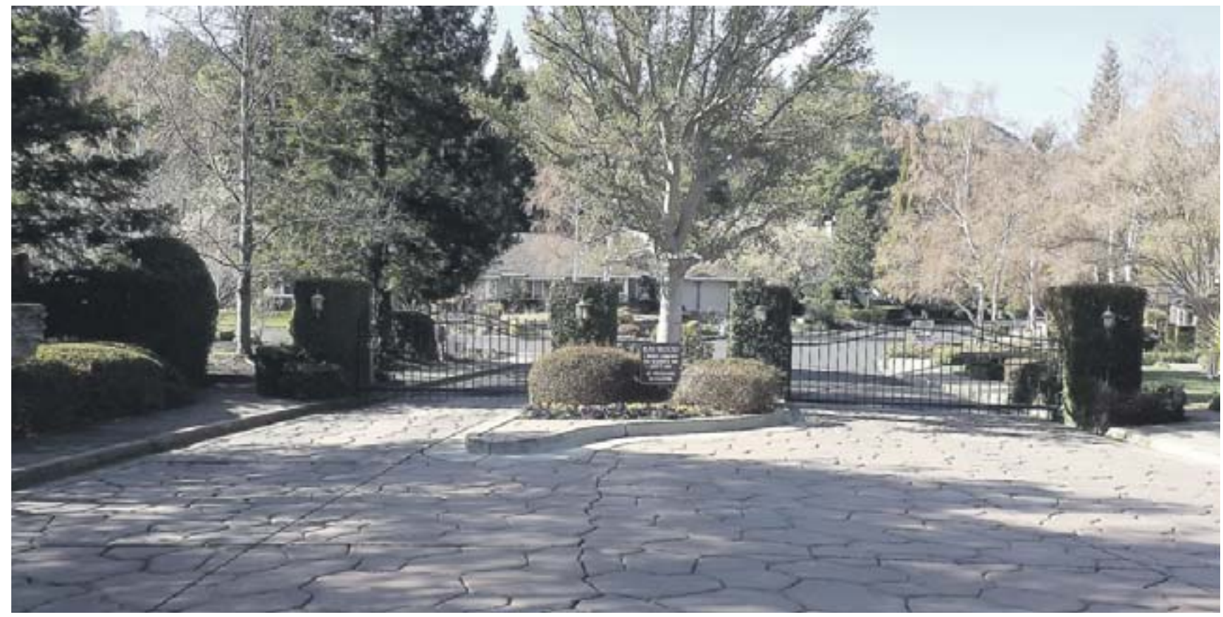
Although Baywood lies in unincorporated Contra Costa County land, its houses bear a Lafayette address and its children attend Lafayette schools.