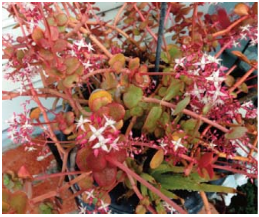
A low maintenance beauty that requires little water is sedum shown here in bloom.