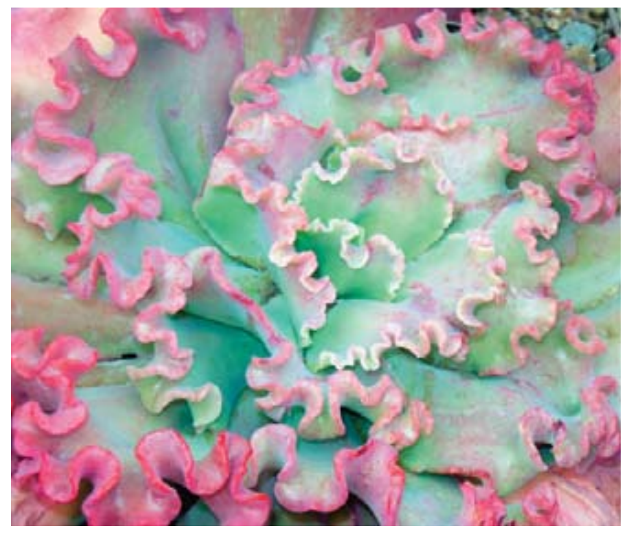
Succulents are attractive. A ruffled echeveria gibbiflora resembles a fleshy red lettuce.

We could decide to turn off the spigot but allowing our gardens to go dry will have negative ramifications including loss of property values, increased heat around our homes, physical and psychological health benefit reductions, loss of recreational activities, decreased air quality, and a larger carbon footprint as we stop growing edibles in our backyards. Since we can't change the weather, we need to change how we respond to it. In my two-part series, I offer my suggestions to help your garden survive the impending dry season without a water bill that breaks the bank.