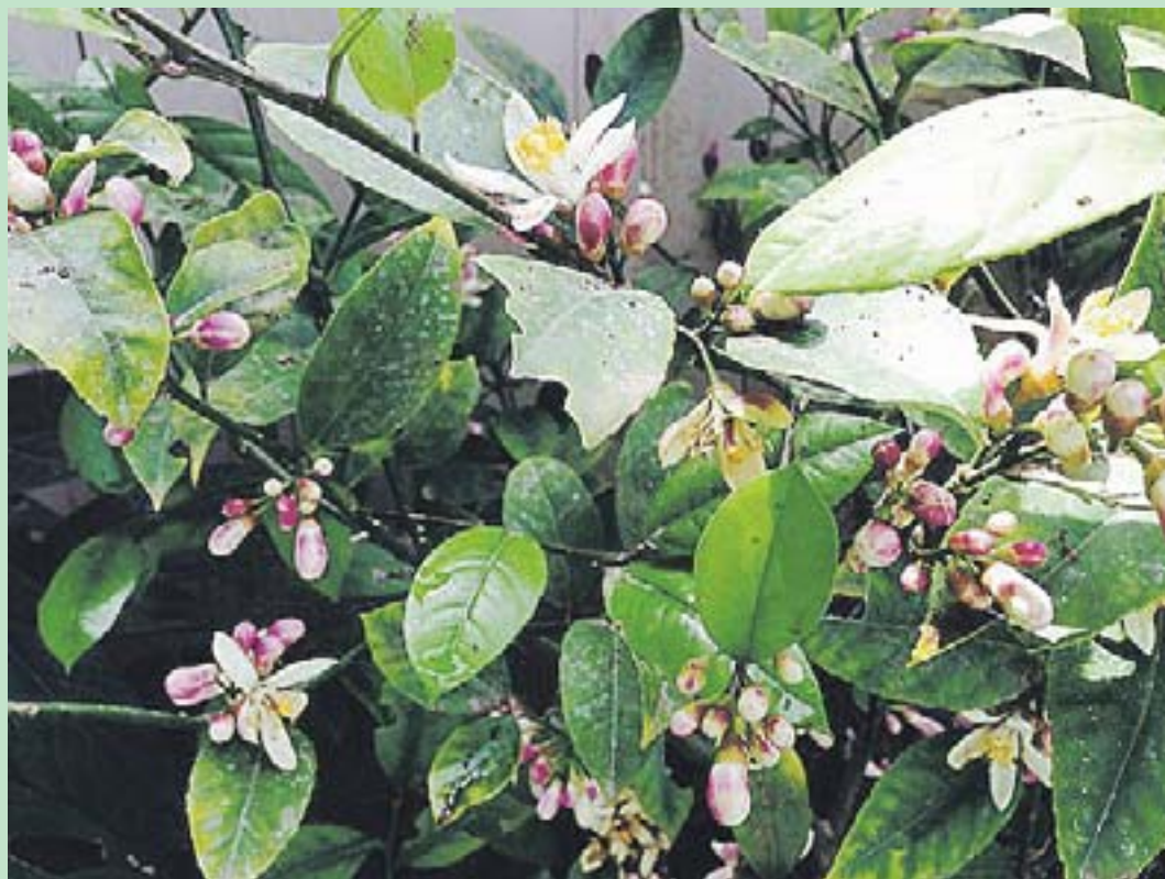
Meyer lemon blossoms fill the air with the fragrance of spring.