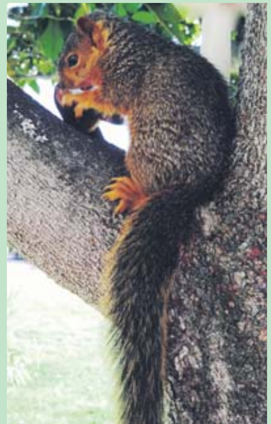
A baby squirrel climbs the magnolia tree with calla lilies underneath.