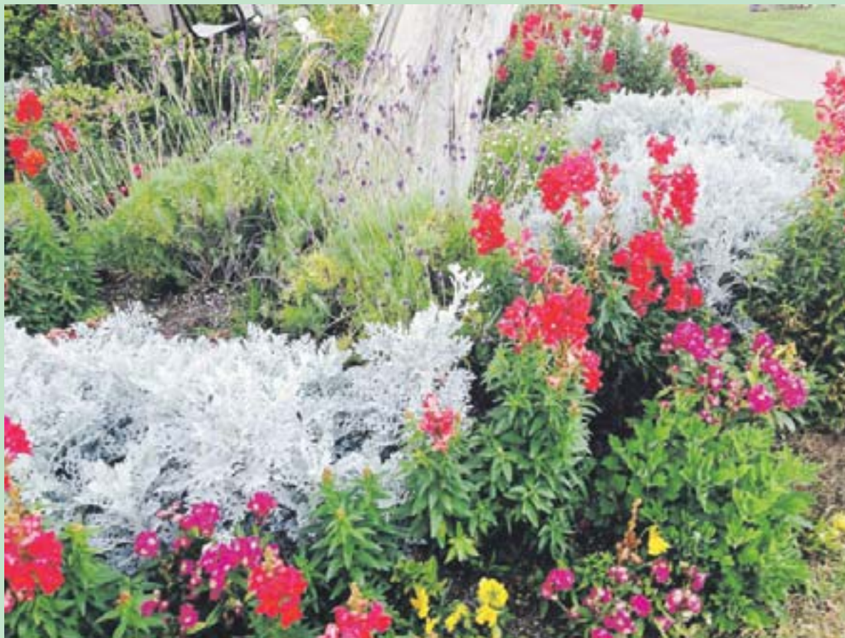
Snapdragons dazzle with color amidst the gray leaves of Artemisia, also known as Dusty Miller.