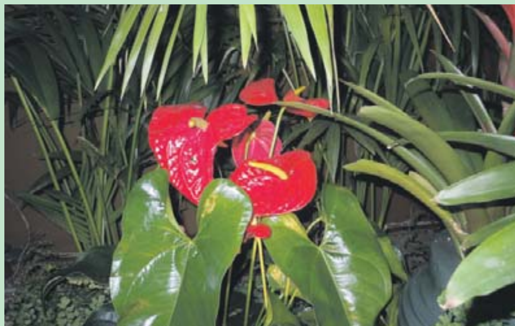
Easy to care for with colorful blooms year round, anthuriums, also known as flamingo flowers, scrub the air of common VOCs.