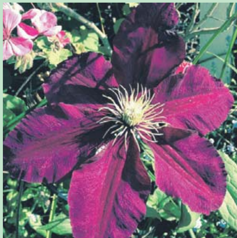
Romantic Clematis surprises perennially with its rich, luscious dinner plate size flowers.