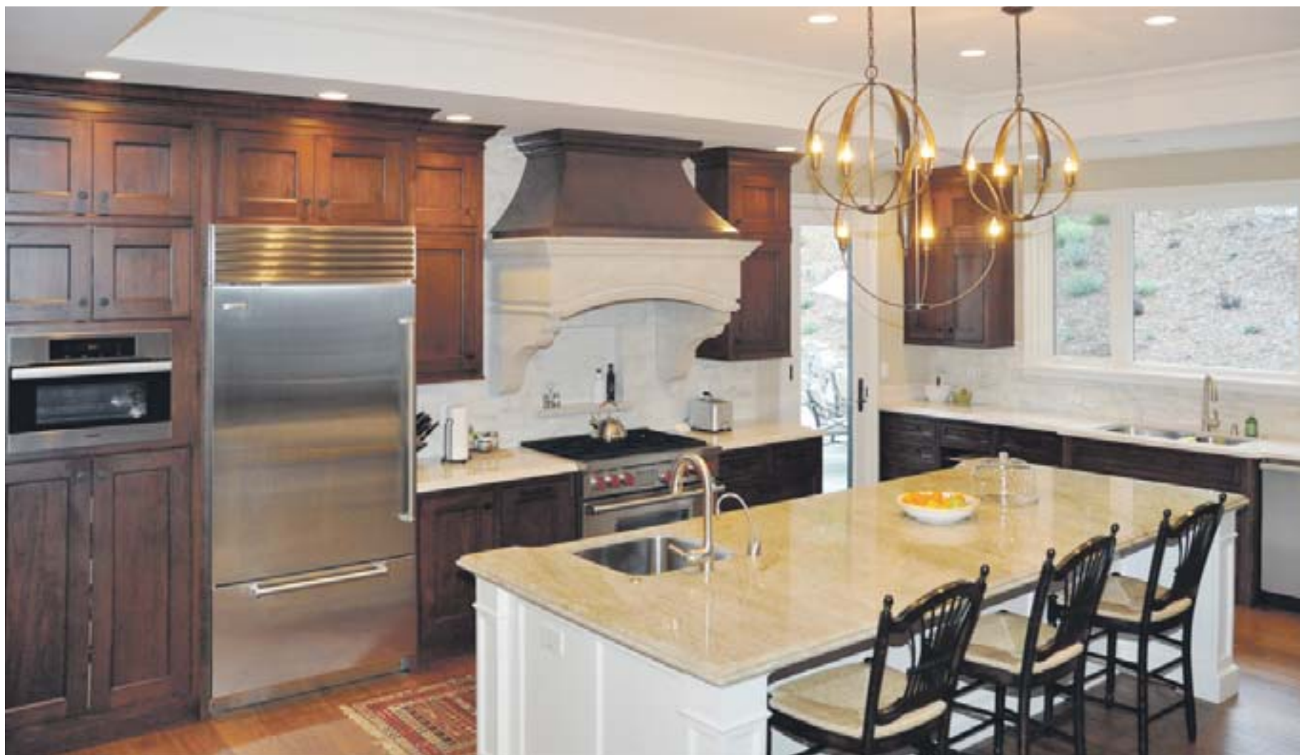
Circular pendant lights and stainless steel appliances give this traditional kitchen a modern edge.

The answer: an English cottage-style kitchen that combines design elements of a more traditional home with modern amenities.