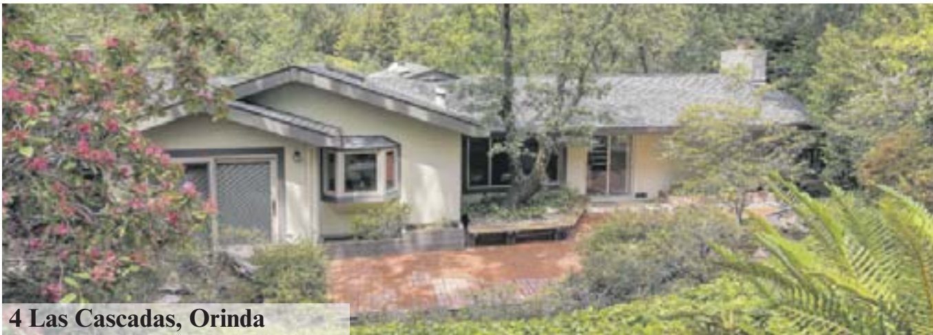
4 Las Cascadas, Orinda