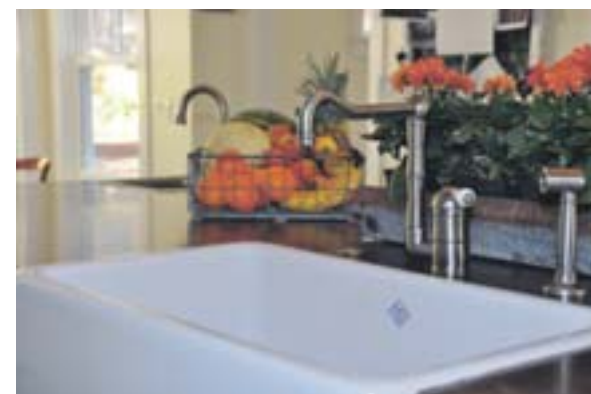
A Shaw's Original Fireclay sink sits on the Alder wood island.