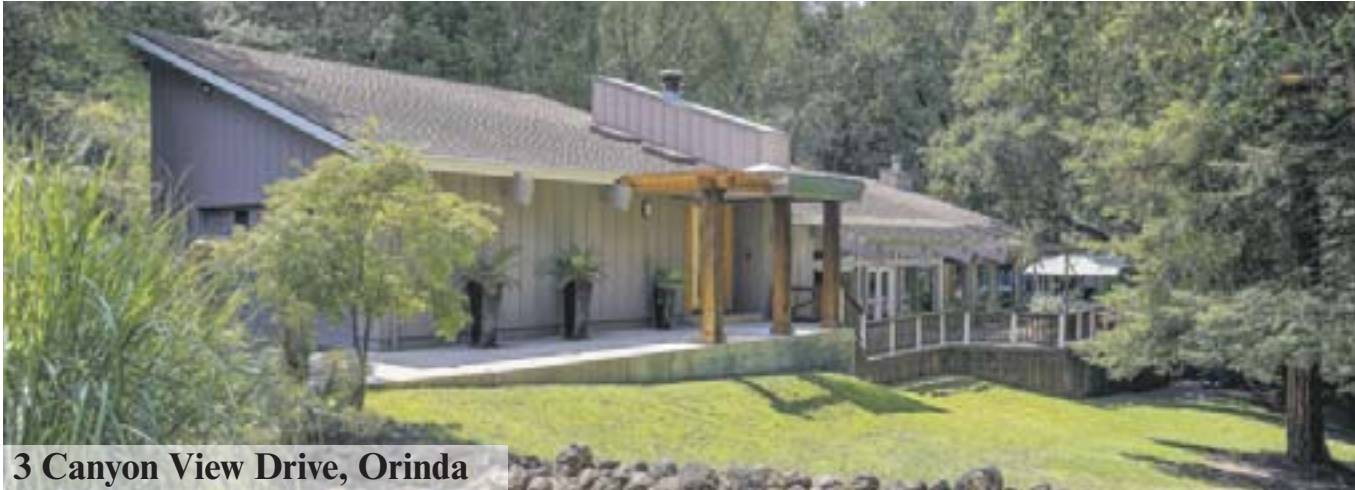
3 Canyon View Drive, Orinda