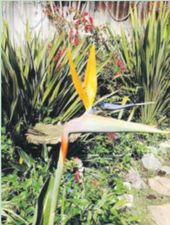
Bird of Paradise adds flair to the landscape and to floral arrangements.