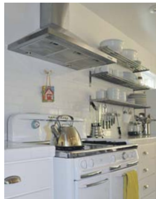
Open metal shelving next to the stove holds the family's plates.

Place for Youth, STAND!, the Lafayette Library, SEED, and Twin Canyon Camp. These organizations were selected by the Lafayette Juniors for the support they provide to children and families in need in Contra Costa and neighboring East Bay counties.