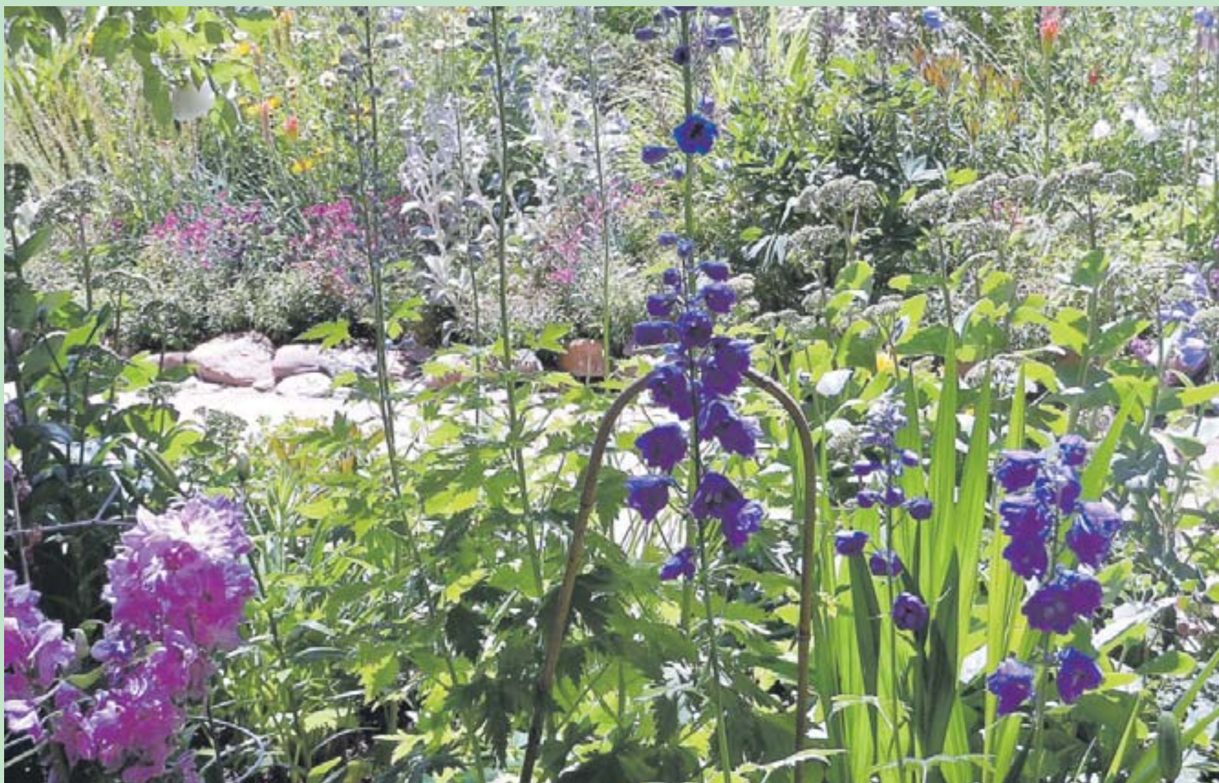
A path lined with larkspur, cineraria, lambs ear, penstemon, and white roses invites a springtime stroll.