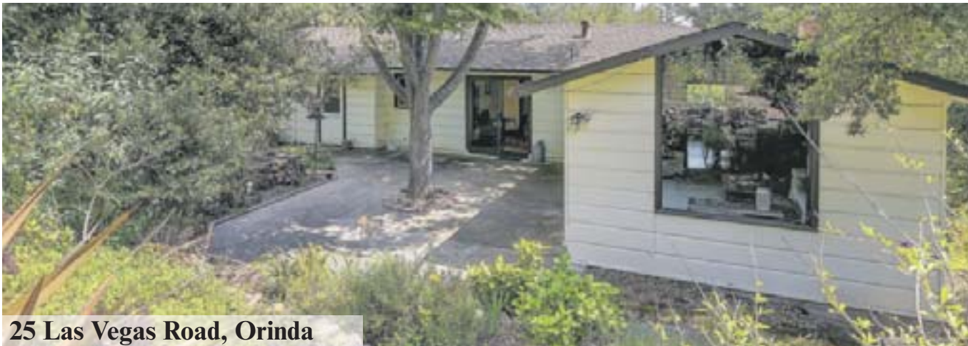
25 Las Vegas Road, Orinda