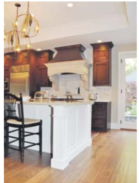
The stone and copper hood serves as the focal point for Douglass's kitchen.