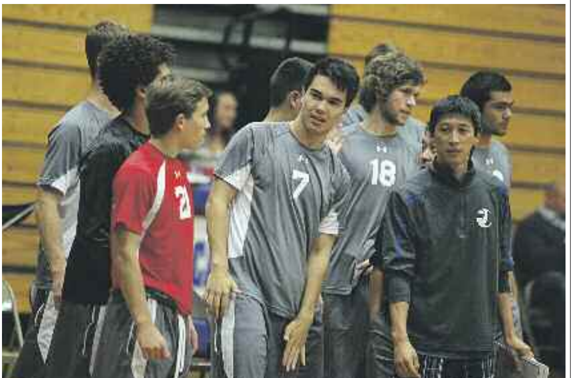
Campolindo prepares to take the court in the NCS tournament.