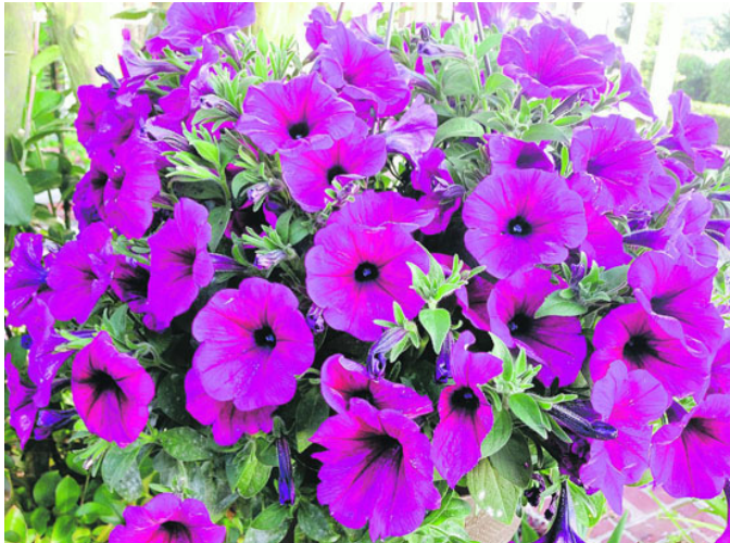
A hanging pot of petunias brightens any patio.