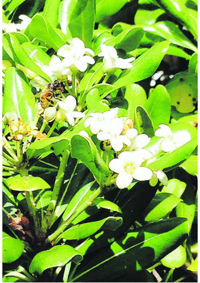
Mock orange tree attracts the bees.